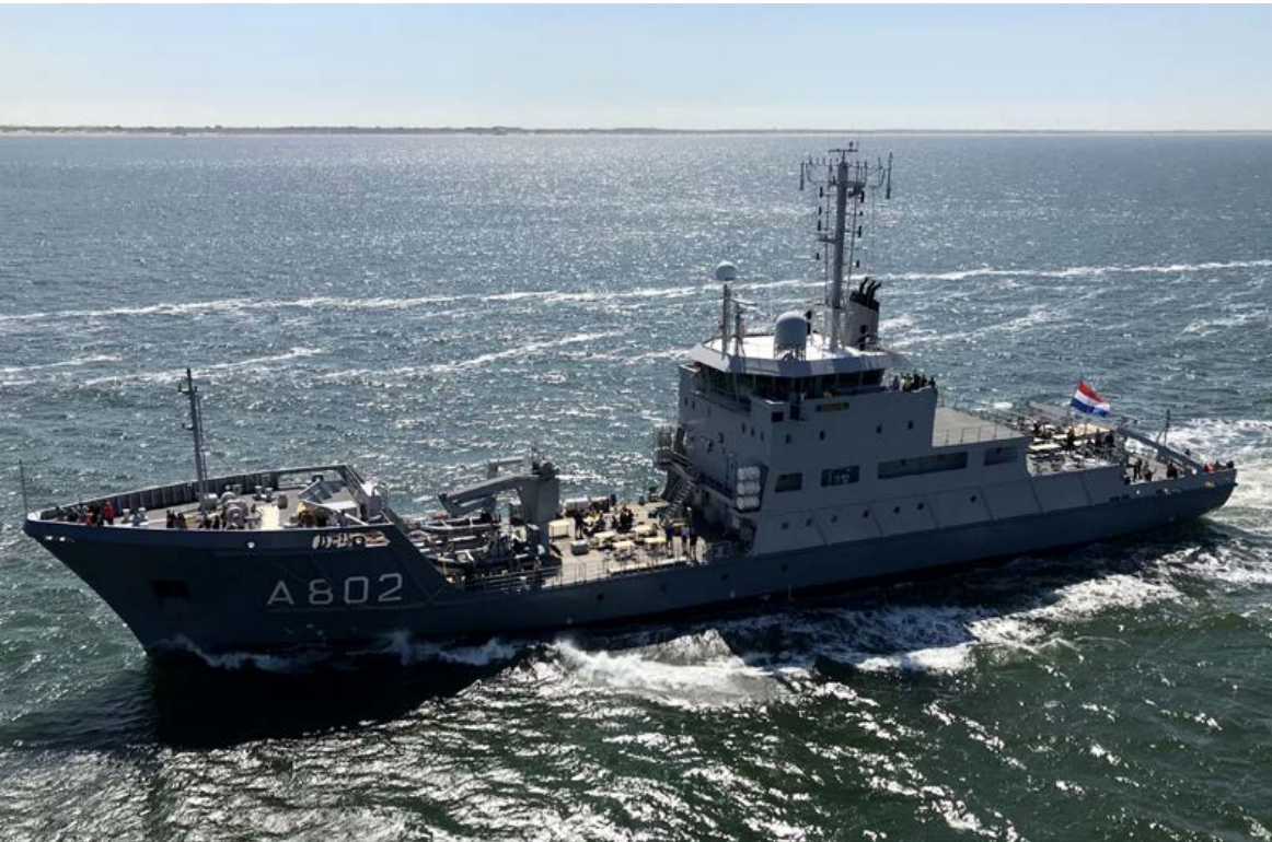
Zr. Ms. Snellius (2020)

CUSTOMER: R+S TYPE: Hydrografic Research Vessel (80 m) TYPE OF WORK: Refit SCOPE OF SUPPLY: Modifications PABX.