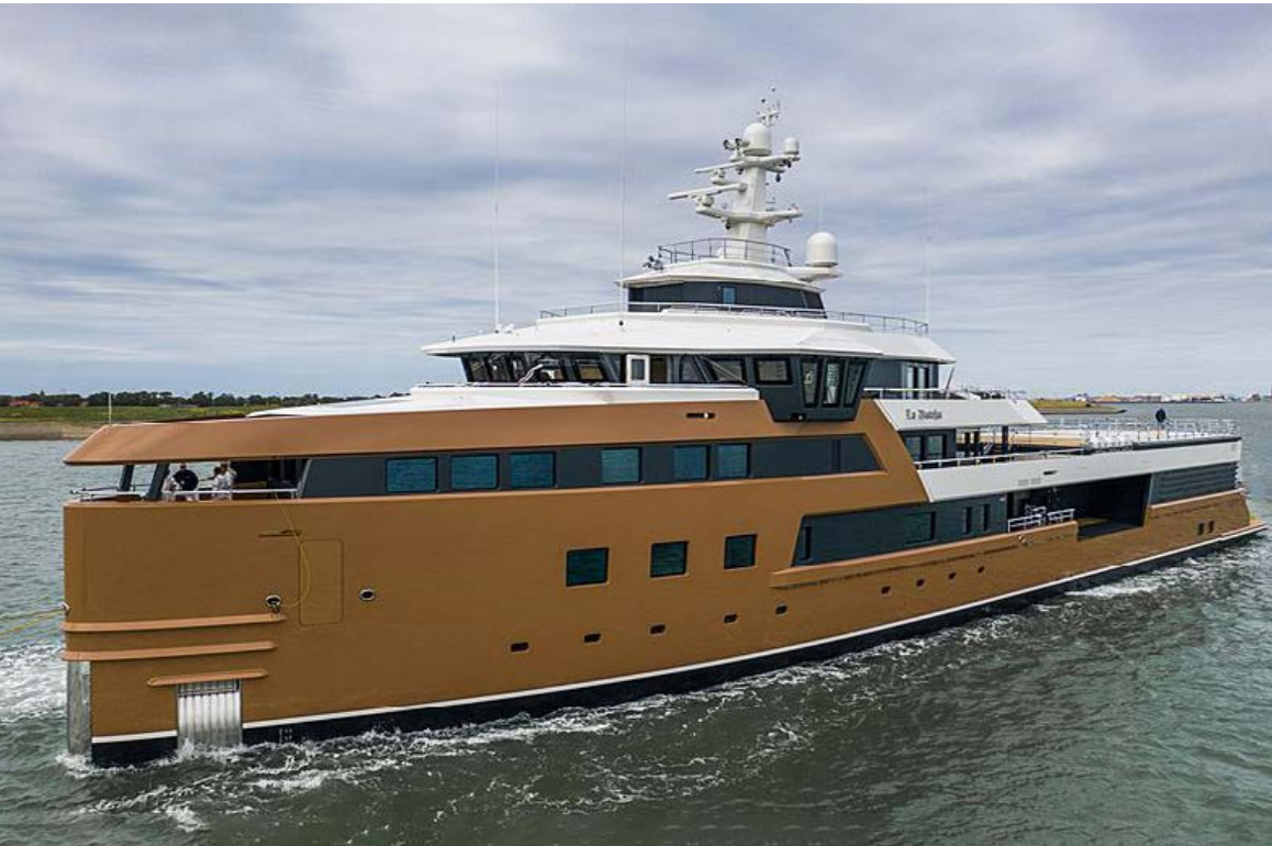
La Datcha (2020)

CUSTOMER: Damen Yachting TYPE: Expedition Yacht (77 m) TYPE OF WORK: Newbuild SCOPE OF SUPPLY: Entertainment system, IT and CCTV system.