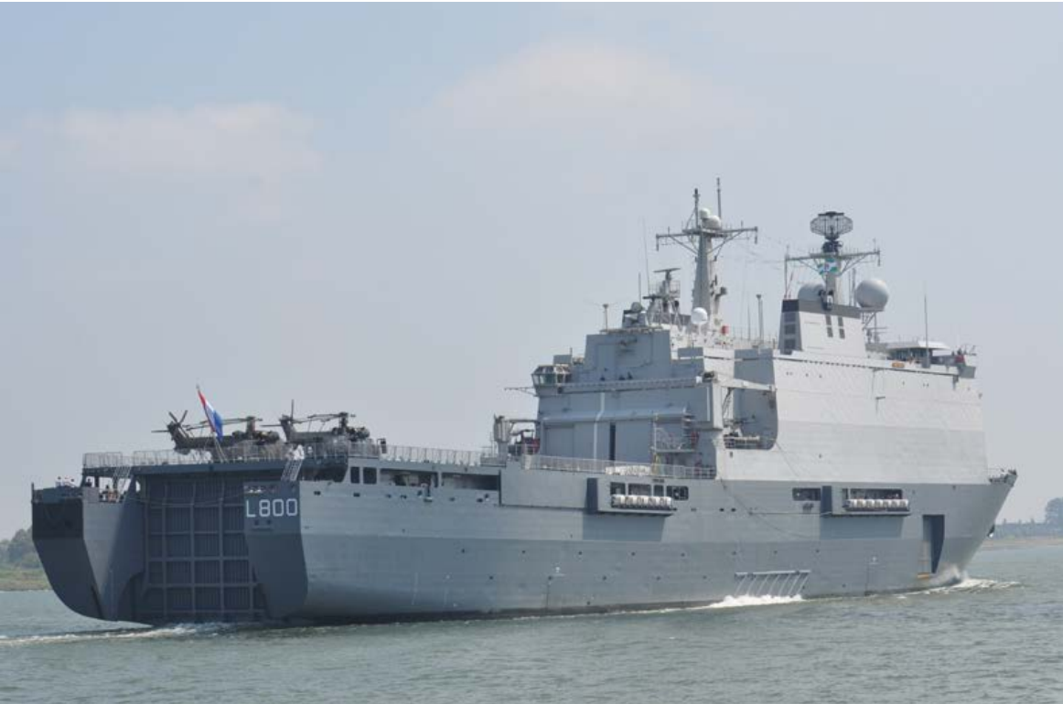
Zr. Ms. Rotterdam (2019)

CUSTOMER: R+S TYPE: Hydrografic Research Vessel (80 m) TYPE OF WORK: Refit SCOPE OF SUPPLY: Modifications PABX.