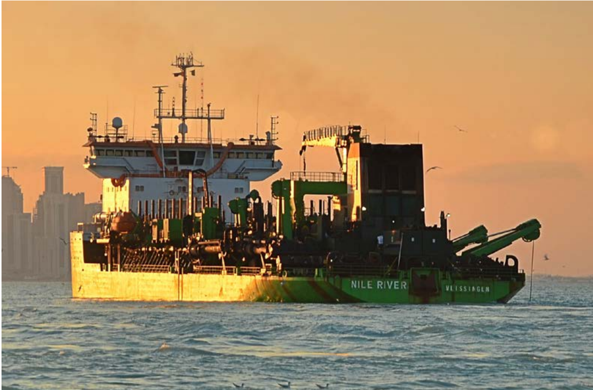
Nile River (2019)

CUSTOMER: DEME TYPE: Trailing Suction Hopper Dredger (3300 m³) TYPE OF WORK: Refit SCOPE OF SUPPLY: Alewijnse Draught and Loading System (ADLS), Alewijnse Suction Tube System (ASTS)