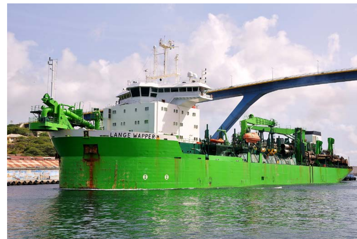
Lange Wapper (2019)

CUSTOMER: DEME TYPE: Trailing Suction Hopper Dredger (5600 m 3 ) TYPE OF WORK: Refit SCOPE OF SUPPLY: Automation Systems