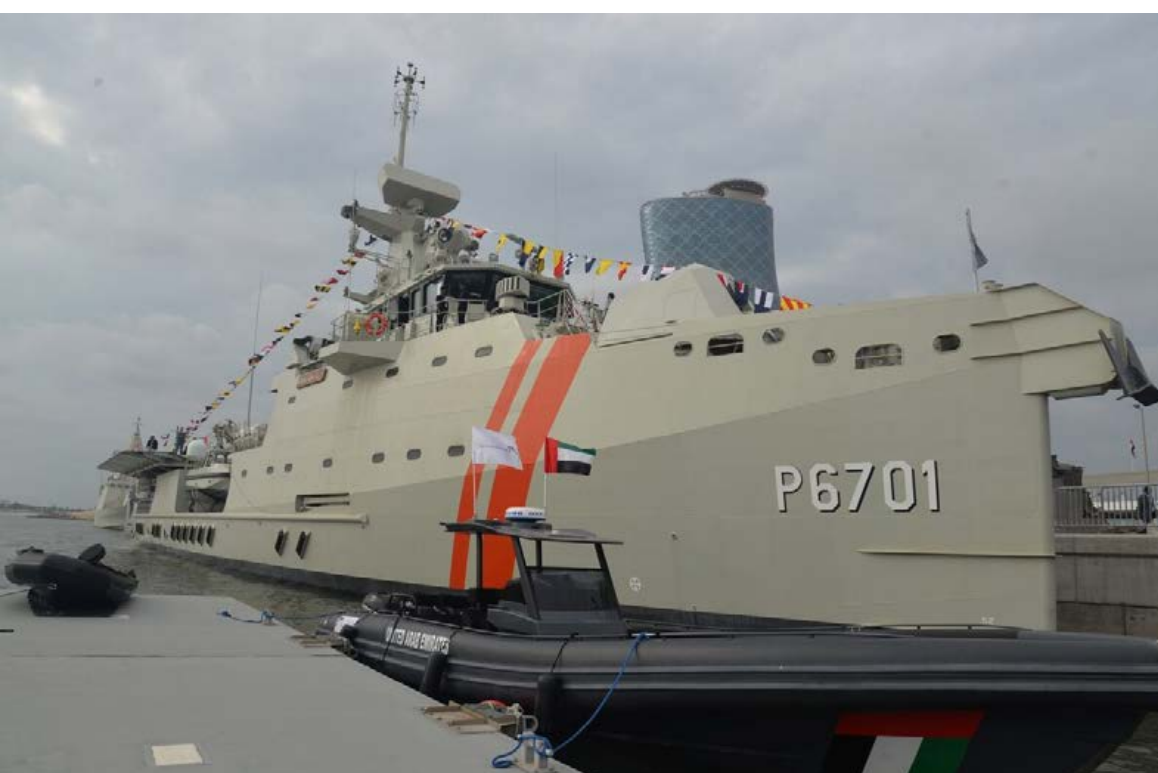
OPV 6711 UAE / Hmeem (2016)

CUSTOMER: Damen Shipyards Gorinchem TYPE: Offshore Patrol Vessel (67 m) TYPE OF WORK: Newbuild SCOPE OF SUPPLY: Electrical package delivery. Engineering, installing and commissioning.