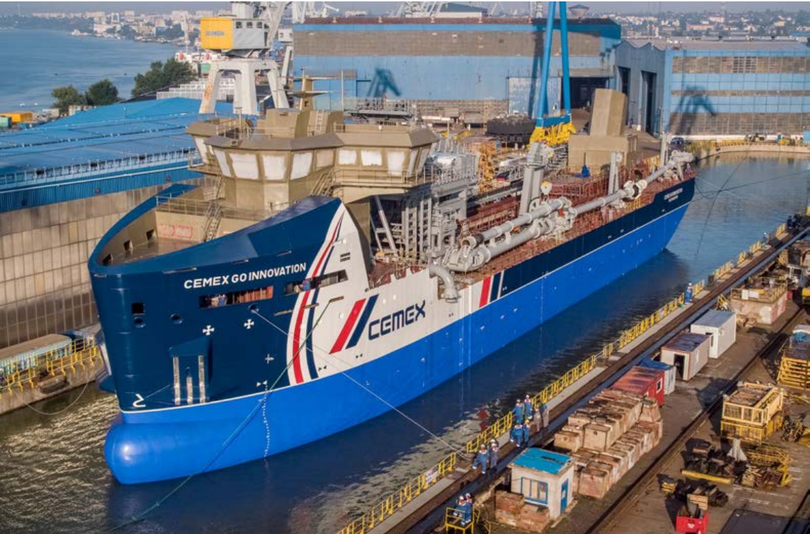
CEMEX Go Innovation (2019)

CUSTOMER: Thecla Bodewes Shipyards TYPE: Trailing Suction Hopper Dredger (3000 m³) TYPE OF WORK: Newbuild SCOPE OF SUPPLY: Electrical Installation and Automation Systems