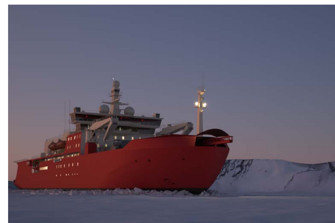
RSV Nuyina (2020)

CUSTOMER: Damen Shipyards Gorinchem TYPE: Offshore Patrol Vessel (67 m) TYPE OF WORK: Newbuild SCOPE OF SUPPLY: Electrical package delivery. Engineering, installing and commissioning.