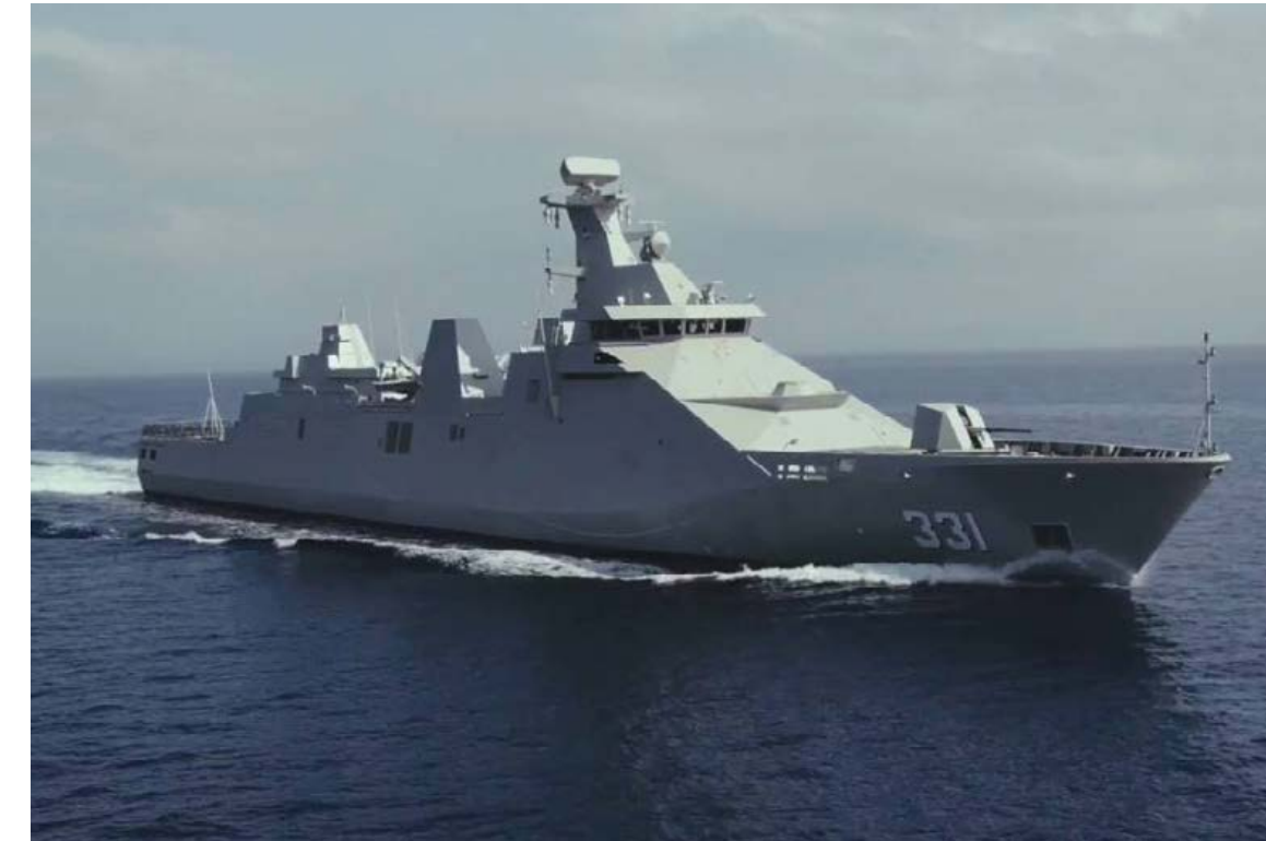
Gusti Ngurah Ra (2017)

CUSTOMER: Damen Schelde Naval Shipbuilding TYPE: Guided-missile Frigate (105,1 m) TYPE OF WORK: Newbuild SCOPE OF SUPPLY: Engineering and integration of platform system, materials and equipment/ system delivery, installing of cable and set to work activities.