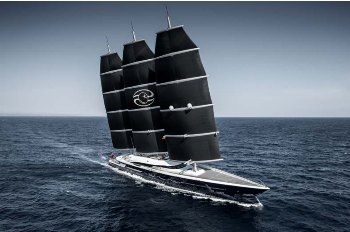
Black Pearl (2018)

CUSTOMER: Oceanco TYPE: Sailing Yacht (106,7 m) TYPE OF WORK: Newbuild SCOPE OF SUPPLY: System integration and complete electrical installation.