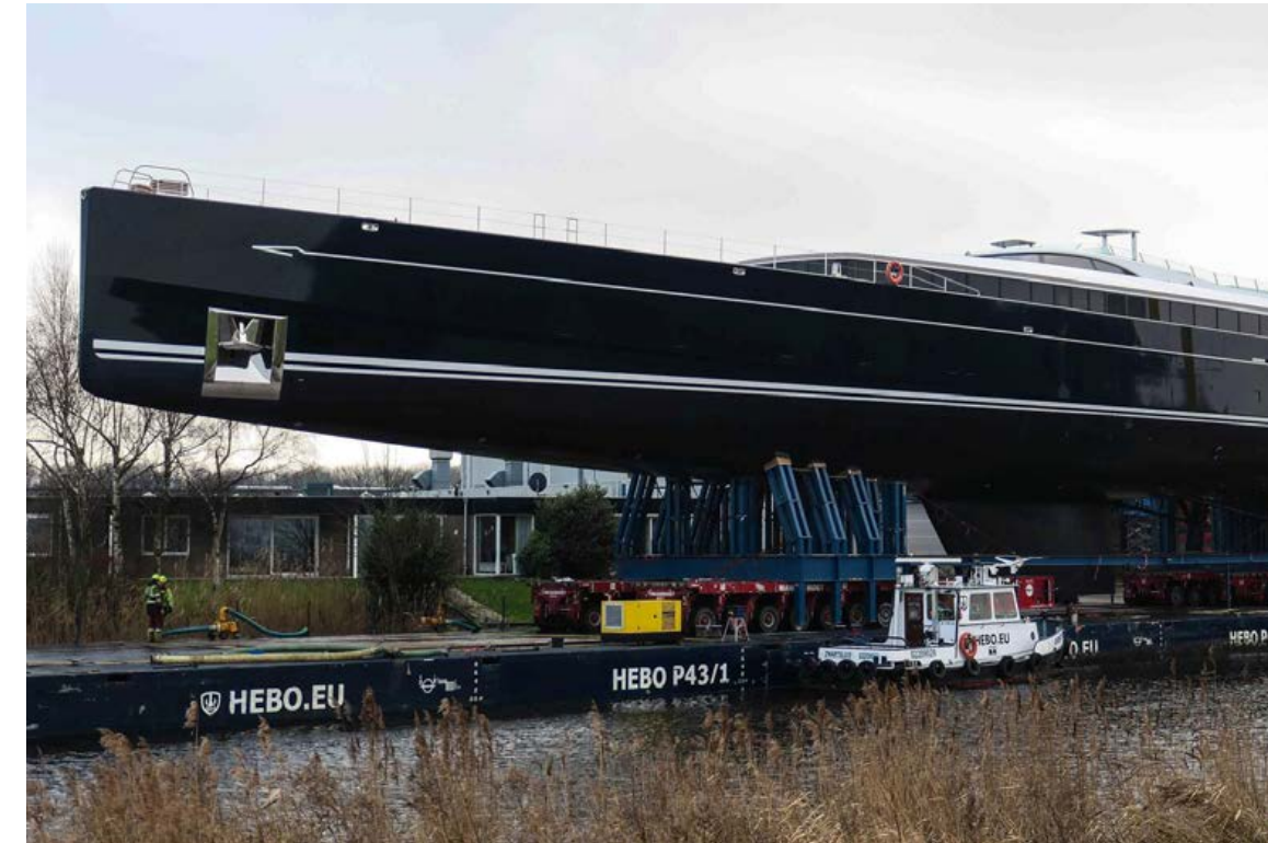
Sea Eagle II (2020)

CUSTOMER: Damen Yachting TYPE: Expedition Yacht (77 m) TYPE OF WORK: Newbuild SCOPE OF SUPPLY: Entertainment system, IT and CCTV system.