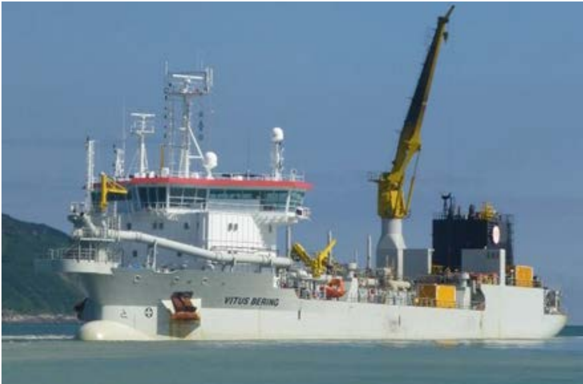
Vitus Bering (2018)

CUSTOMER: Jan de Nul TYPE: Hopper Dredger (7500 m³) TYPE OF WORK: Refit SCOPE OF SUPPLY: PC renewal AMCS + Refit DCS