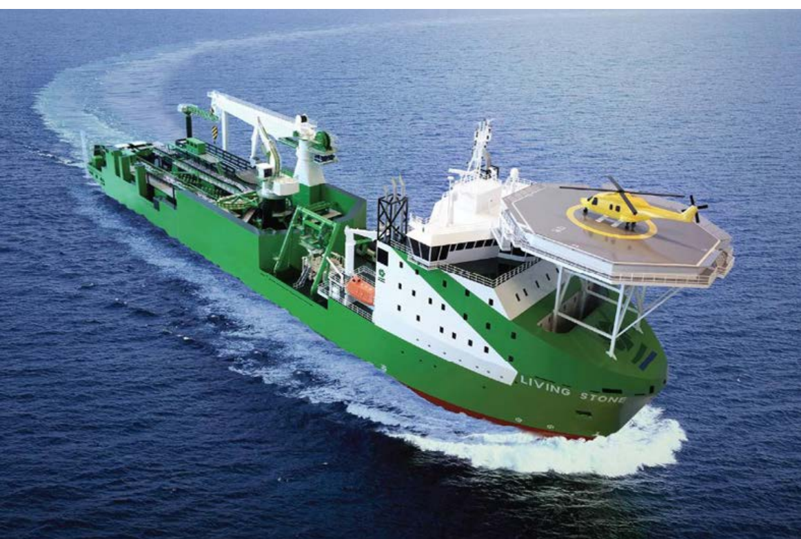
Living Stone (2018)

CUSTOMER: DEME TYPE: Jack-Up Vessel (89 m) TYPE OF WORK: Refit SCOPE OF SUPPLY: Installation Helideck