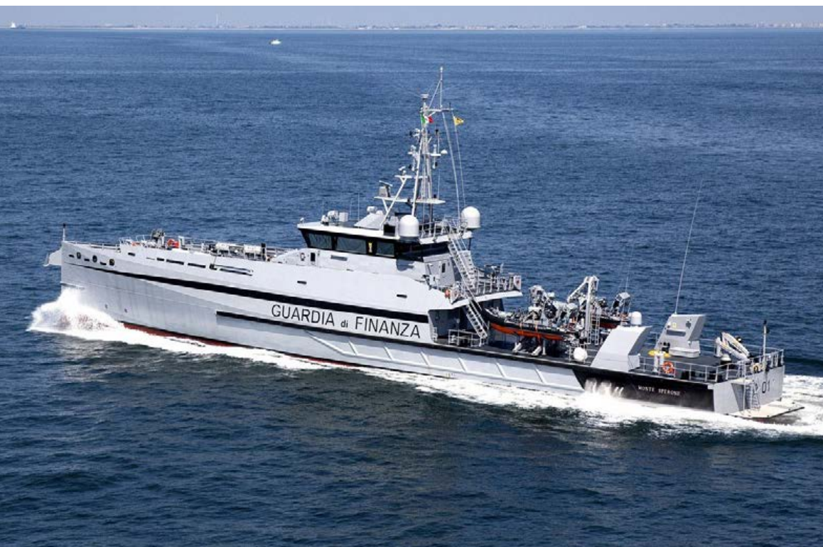
Stan Patrol 5509 (2015)

CUSTOMER: Damen Schelde Naval Shipbuilding TYPE: Guided-missile Frigate (105,1 m) TYPE OF WORK: Newbuild SCOPE OF SUPPLY: Engineering and integration of platform system, materials and equipment/ system delivery, installing of cable and set to work activities.