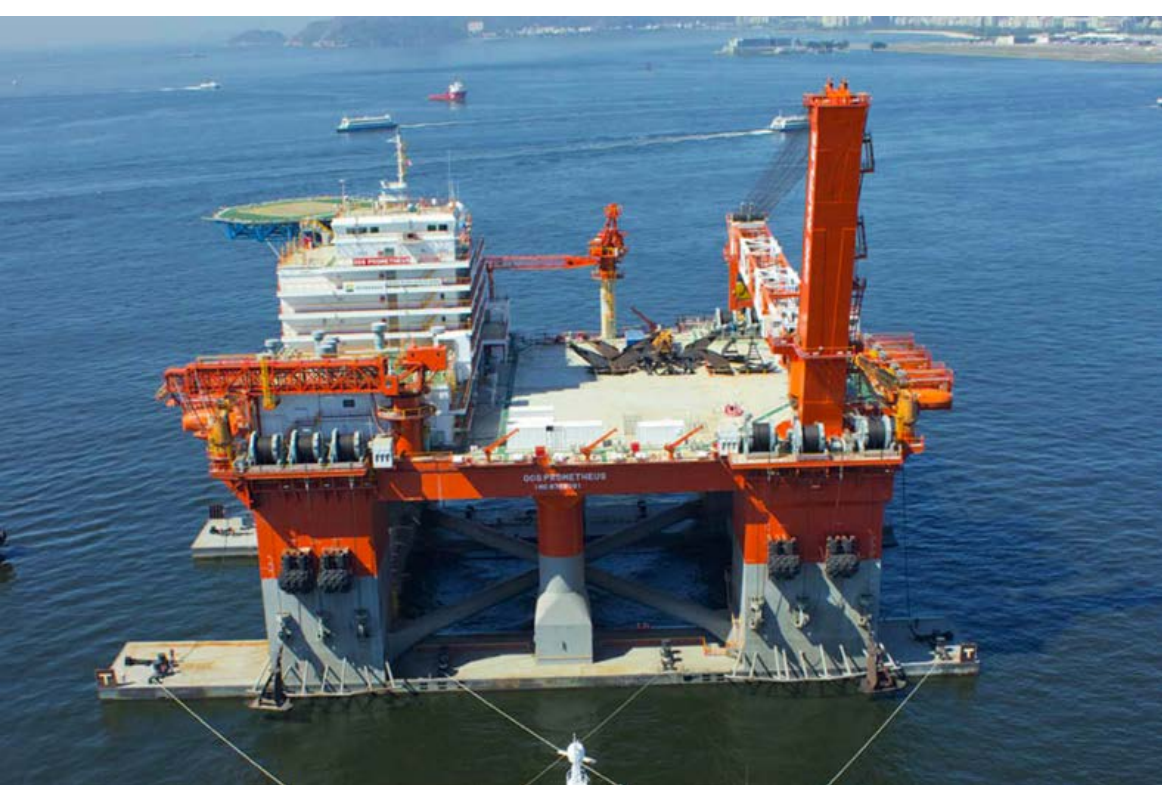
OOS Promotheus (2013)

CUSTOMER: Allseas TYPE: Offshore Construction Vessel (150 m) TYPE OF WORK: Service SCOPE OF SUPPLY: Automation window heating system