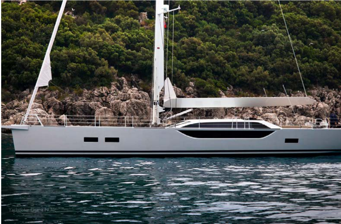
Bliss II (2014)

CUSTOMER: Oceanco / Vitters TYPE: Sailing Yacht (85 m) TYPE OF WORK: Newbuild SCOPE OF SUPPLY: System integration, complete electrical installation, navigation & communication system.