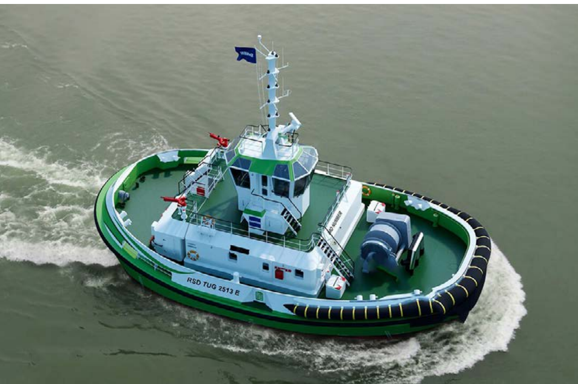
RSD2513 YN515011-16 (2020)

CUSTOMER: Damen Shipyards Gorinchem TYPE: Tug boat (23 m) TYPE OF WORK: Newbuild SCOPE OF SUPPLY: Switchboards and consoles