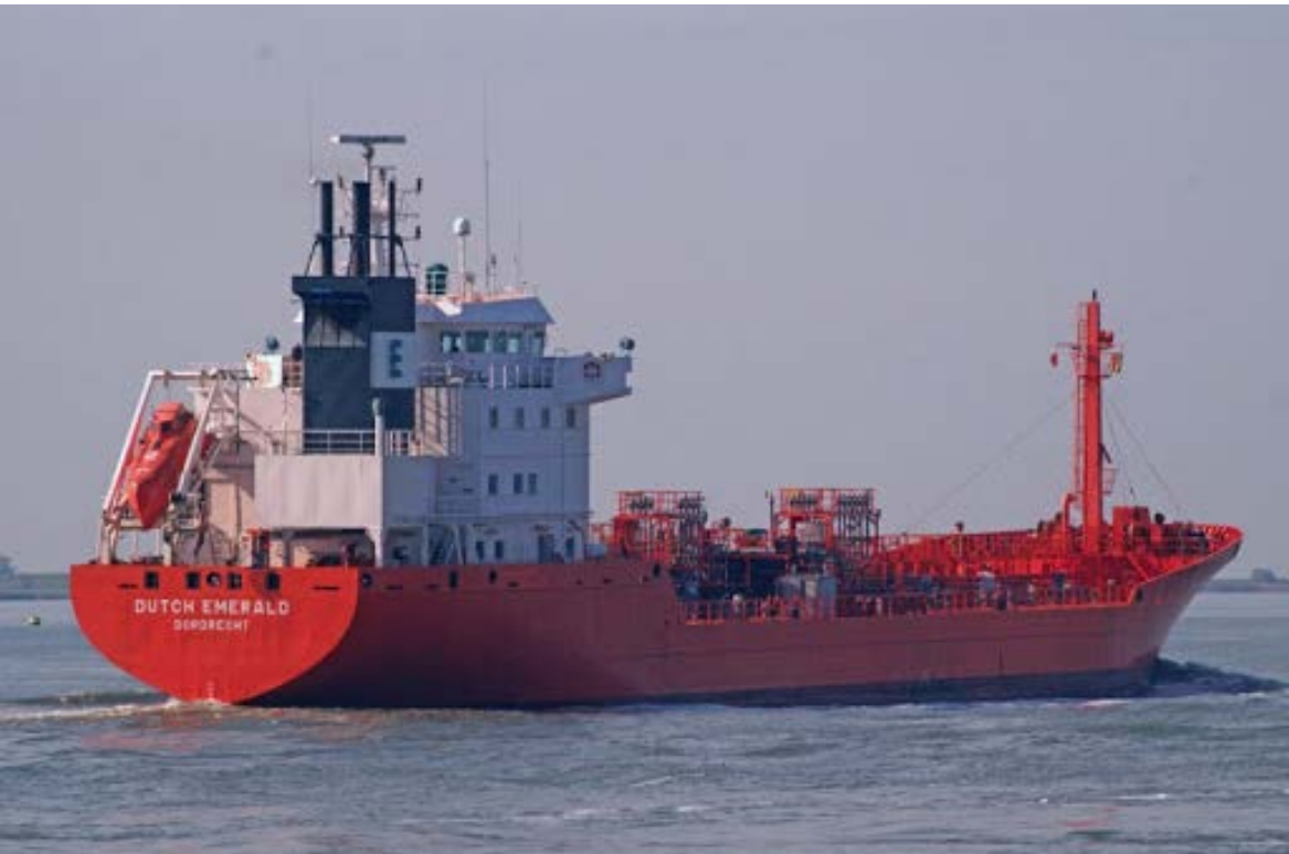
Dutch Emerald (2000)

CUSTOMER: VEKA Shipyard Lemmer TYPE: Chemical oil product tanker TYPE OF WORK: Newbuild SCOPE OF SUPPLY: Engineering, installation and commissioning of complete electrical installation, including alarm, monitoring and control systems, electrical distribution systems, power management system.