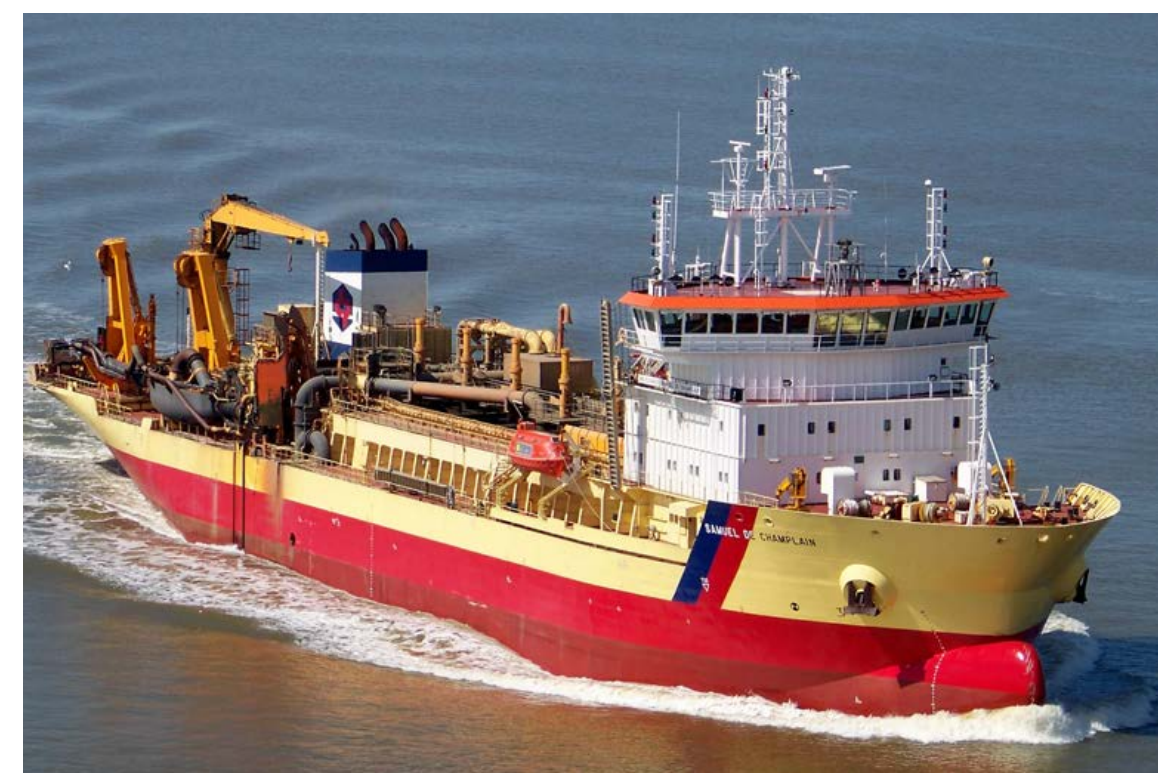
Samuel de Champlain (2018)

CUSTOMER: DEME TYPE: Trailing Suction Hopper Dredger (13700 m 3 ) TYPE OF WORK: Refit SCOPE OF SUPPLY: Automation Systems, Draught and Loading System (ADLS), Alewijnse Suction Tube System (ASTS)