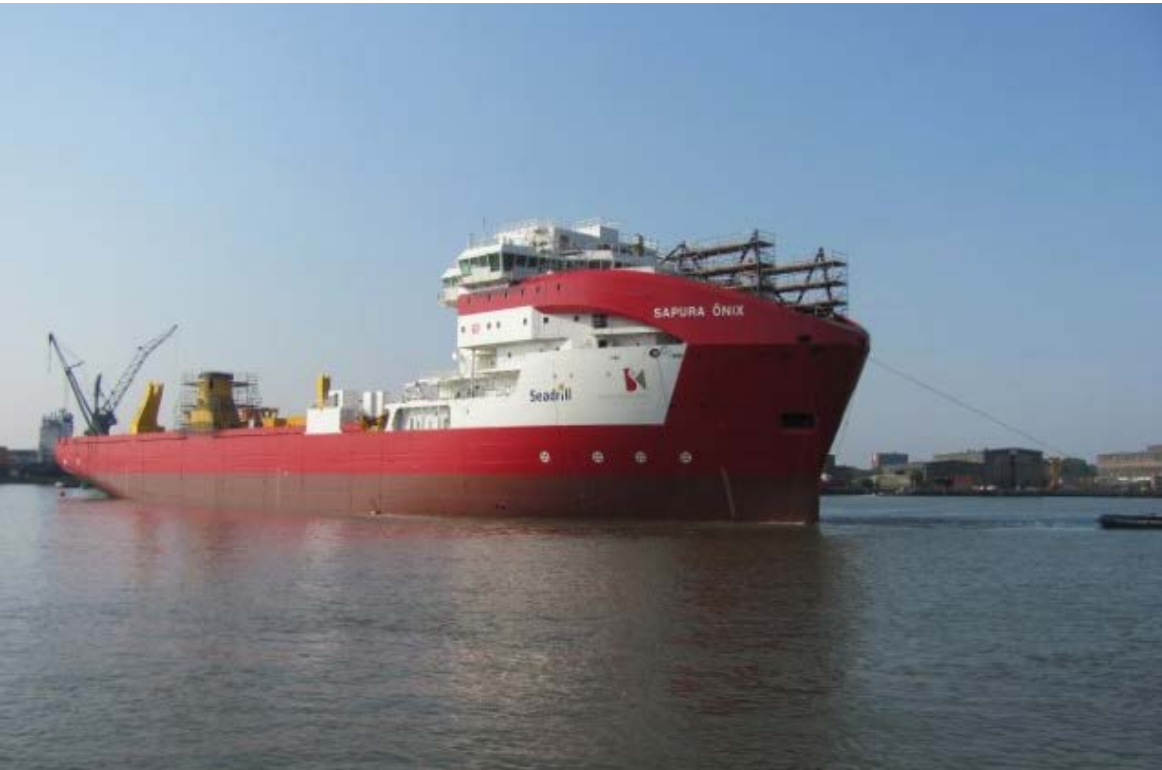
Sapura Onix (2015)

CUSTOMER: IHC Offshore & Marine TYPE: Pipe Laying Support Vessel (145 m) TYPE OF WORK: Newbuild SCOPE OF SUPPLY: System Integration, complete electrical installation.