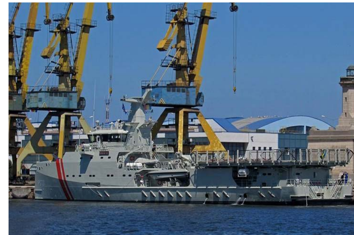
OPV 6711 UAE / Arialah (2016)

CUSTOMER: Damen Shipyards Gorinchem TYPE: Offshore Patrol Vessel (55 m) TYPE OF WORK: Newbuild SCOPE OF SUPPLY: Electrical package delivery. Engineering, installing and commissioning.