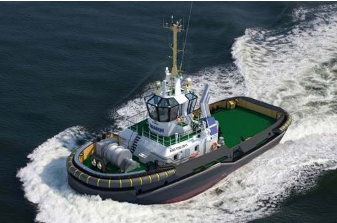
ASD2811 YN513213-14 (2020)

CUSTOMER: Damen Shipyards Gorinchem TYPE: Tug boat (28 m) TYPE OF WORK: Newbuild SCOPE OF SUPPLY: Switchboards and consoles