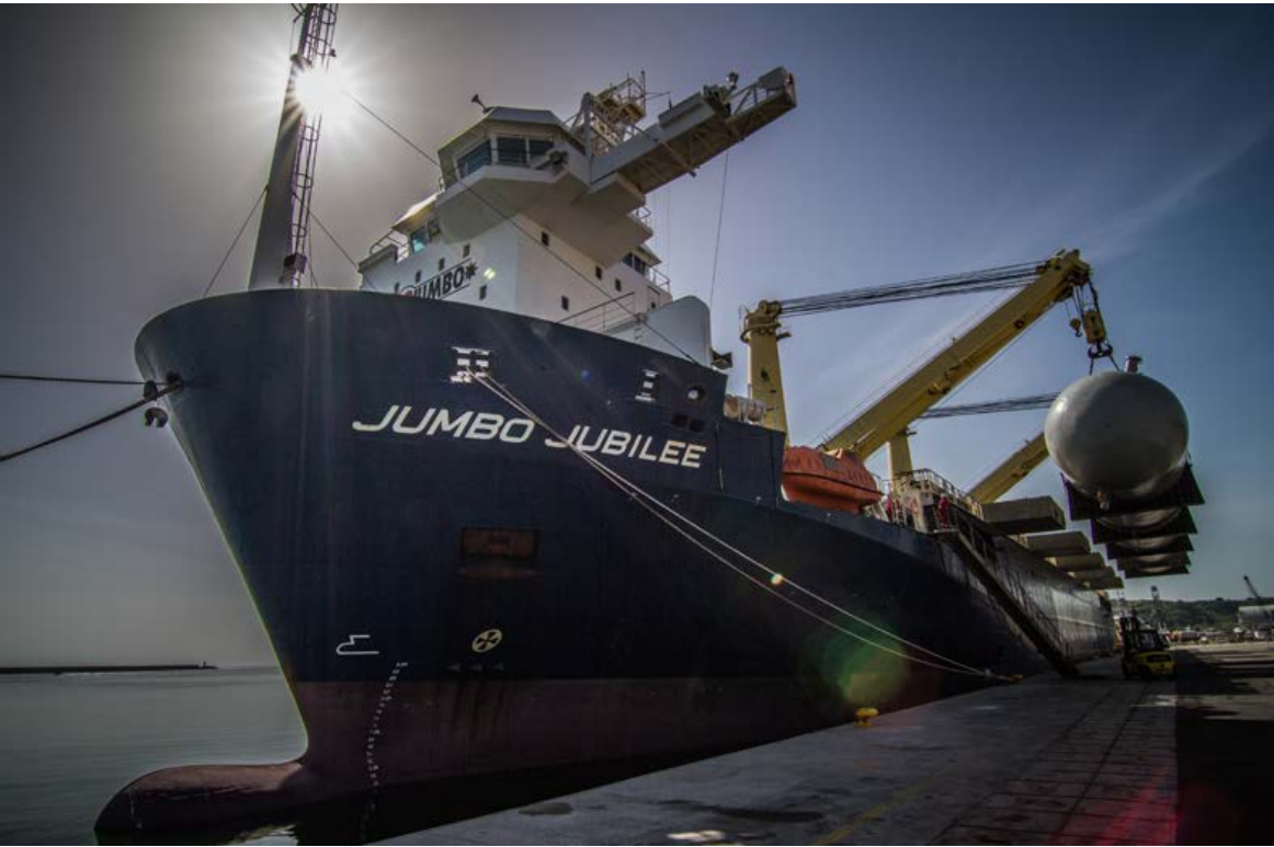
Jumbo Jubilee (2019)

CUSTOMER: Jumbo Maritime TYPE: Heavy Load Carrier (145 m) TYPE OF WORK: Service SCOPE OF SUPPLY: Power distribution system