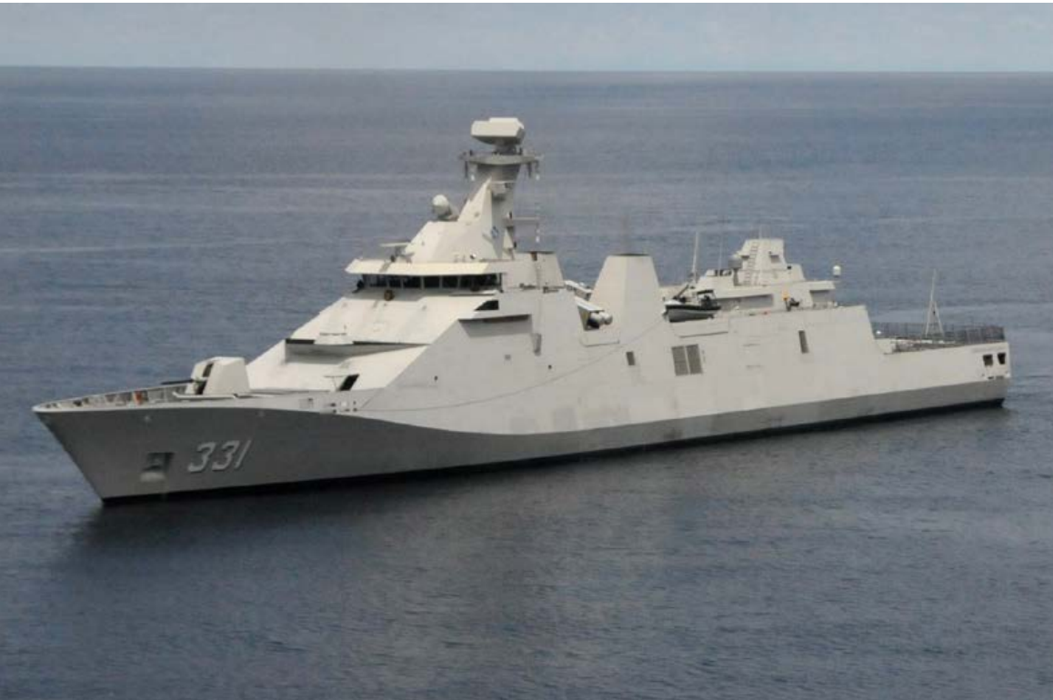
KRI Raden Eddy Martadinata (2017)

CUSTOMER: Damen Schelde Naval Shipbuilding TYPE: Guided-missile Frigate (105,1 m) TYPE OF WORK: Newbuild SCOPE OF SUPPLY: Engineering and integration of platform system, materials and equipment/ system delivery, installing of cable and set to work activities.