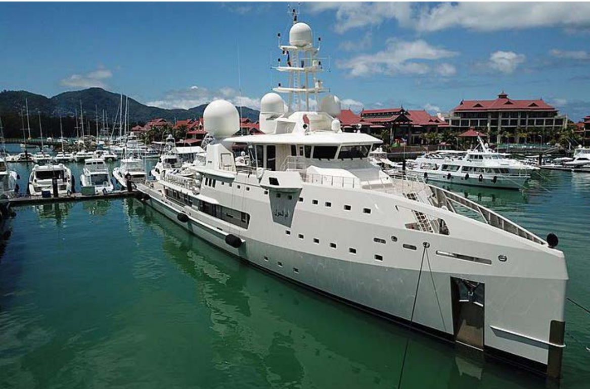
Al Adaam (2013)

CUSTOMER: Milaha Shipyard Qatar TYPE: Motor Yacht (47 m) TYPE OF WORK: Newbuild SCOPE OF SUPPLY: Electrical Package Delivery.