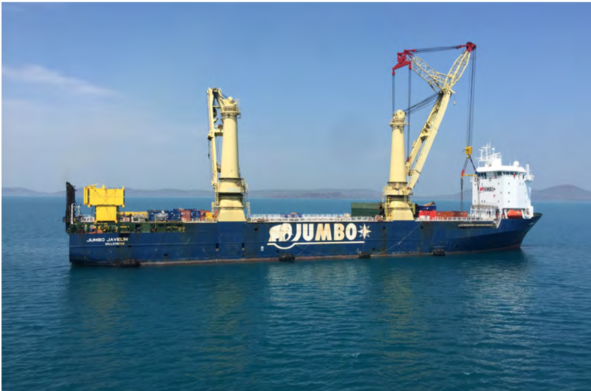
Jumbo Javelin (2020)

CUSTOMER: Damen Shiprepair Rotterdam TYPE: Oceanographic Survey Vessel (85,3 m) TYPE OF WORK: Refit SCOPE OF SUPPLY: Electrical outfitting, update DP (dp 2), upgrade bridge system, farsounder, panels, shore connection, lighting system (lutron/pharos), pulling and terminating 205km cables.