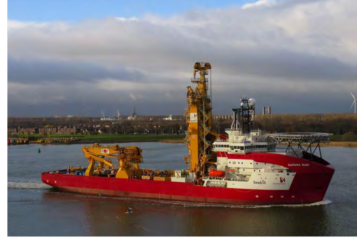
Sapura Rubi (2016)

CUSTOMER: Damen Shipyards Gorinchem TYPE: Cable Layer (122,63 m) TYPE OF WORK: Newbuild SCOPE OF SUPPLY: System Integration, complete electrical installation.