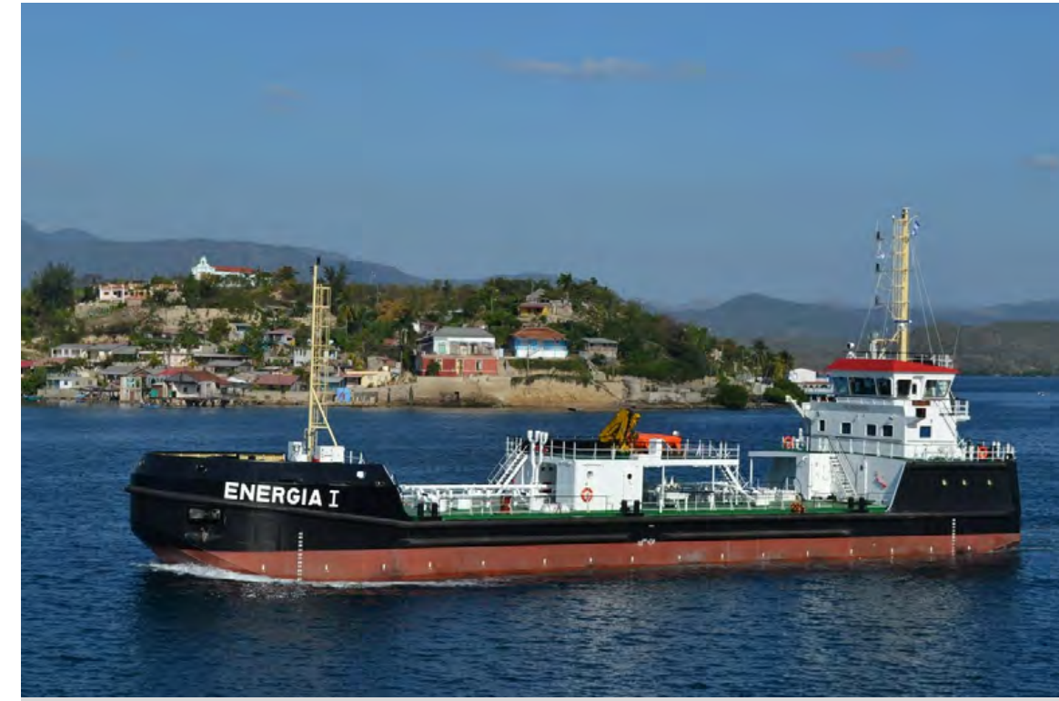
Energia I (2015)

CUSTOMER: Bodewes Shipyards Hoogezand TYPE: 2.850 m 3 oil tanker TYPE OF WORK: Newbuild SCOPE OF SUPPLY: Engineering, installation and commissioning of complete electrical installation, including alarm, monitoring and control systems, electrical distribution systems.