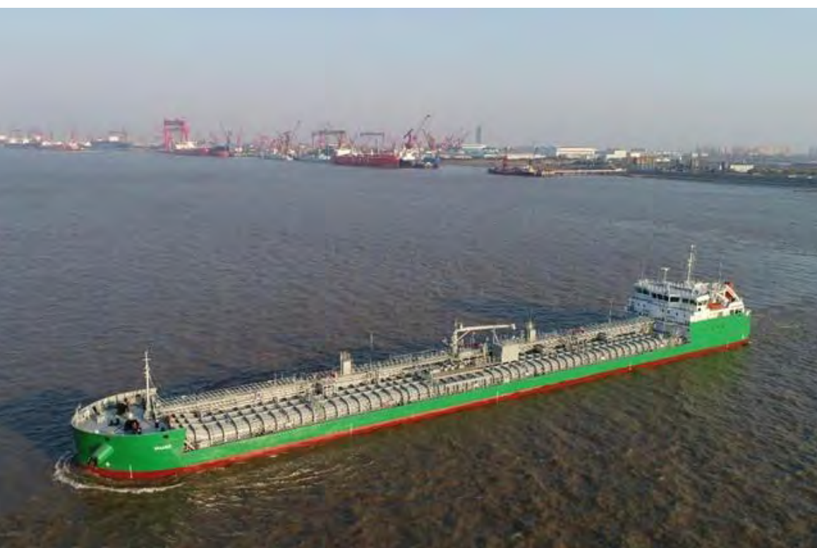
Maaik and Linda (2018)

CUSTOMER: Severnav Shipyard TYPE: 6500 m 3 liquefied gas tanker and 8600 m 3 gas tankers TYPE OF WORK: Newbuild SCOPE OF SUPPLY: Complete electrical package, including engineering, commissioning, alarm, monitoring and control systems.