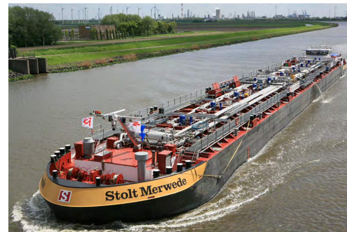
Stolt Waal, Main, Maas, Mosel, Rhine and Merwede (2018)

CUSTOMER: Damen Shipyards Gorinchem TYPE: Combi Freighter (88 m) TYPE OF WORK: Newbuild SCOPE OF SUPPLY: Infrastructure (Cable Routing, Cable Trays), switchboards and consoles.