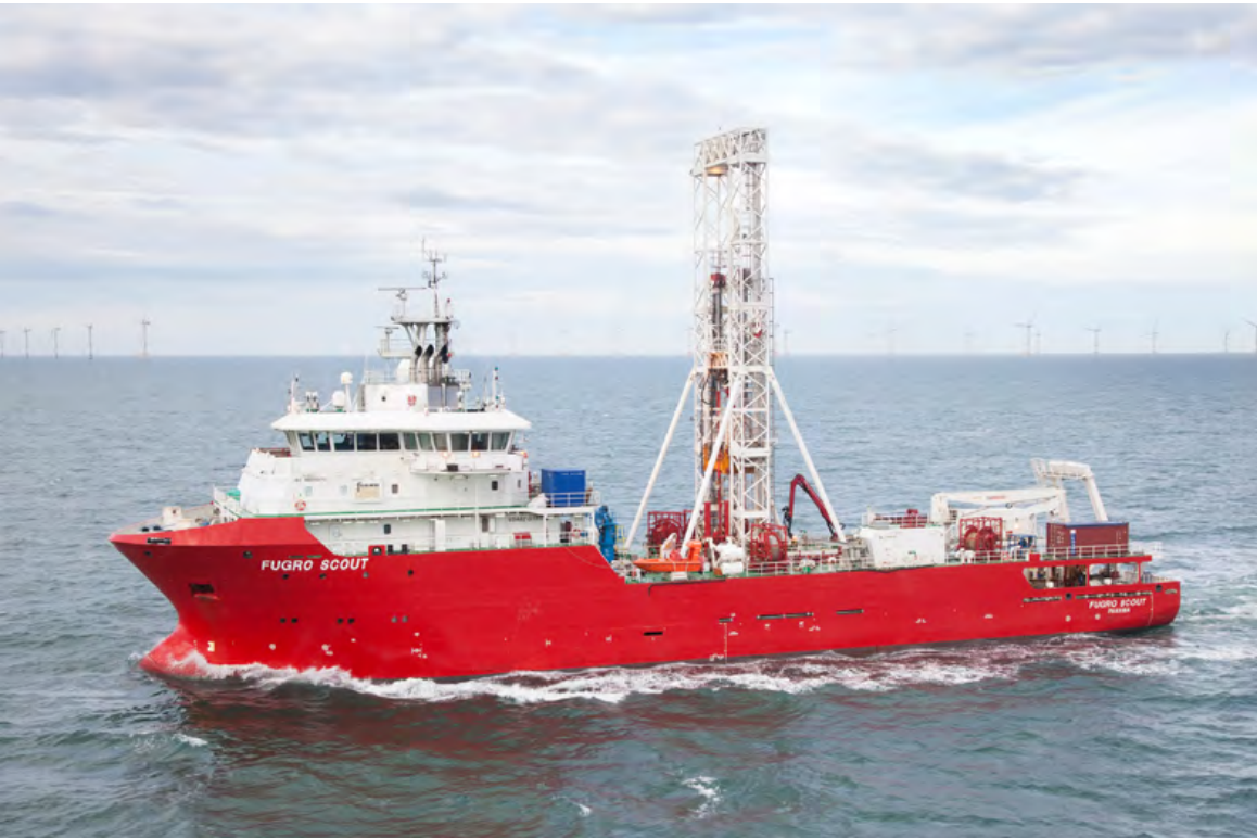
Fugro Venturer (2017)

CUSTOMER: Fassmer TYPE: Research & Survey vessel (72 m) TYPE OF WORK: Newbuild SCOPE OF SUPPLY: System integration, vessel automation, power distribution system; navigation and communication system, consoles.