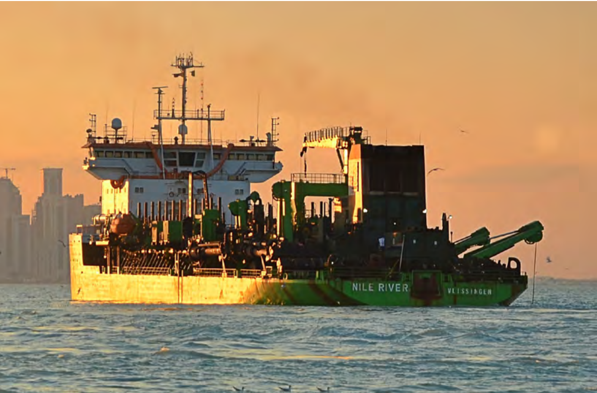
Nile River (2019)

CUSTOMER: DEME TYPE: Trailing Suction Hopper Dredger (3300 m³) TYPE OF WORK: Refit SCOPE OF SUPPLY: Alewijnse Draught and Loading System (ADLS), Alewijnse Suction Tube System (ASTS)