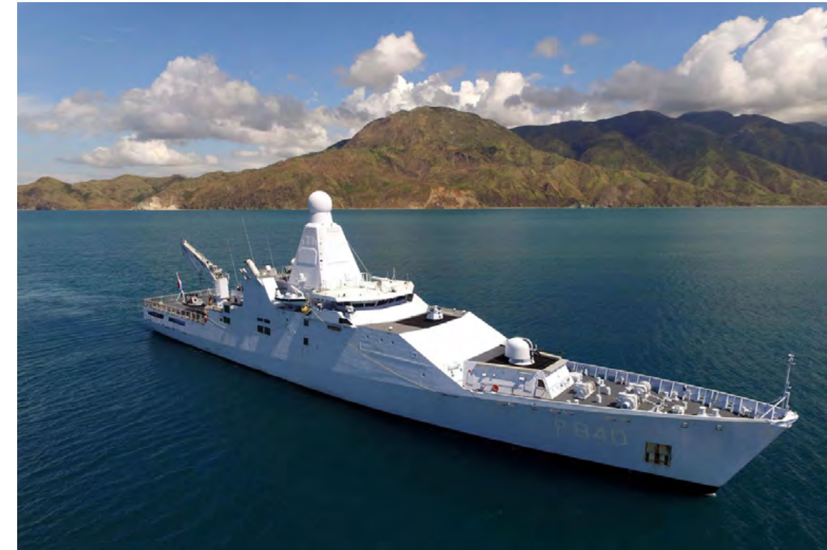
Zr. Ms. Holland (2012)

CUSTOMER: Damen Schelde Naval Shipbuilding TYPE: Joint Logistic Support Ship (204,7 m) TYPE OF WORK: Newbuild SCOPE OF SUPPLY: Installation of the electrical systems including command & control, PDU and production of 44 consoles.