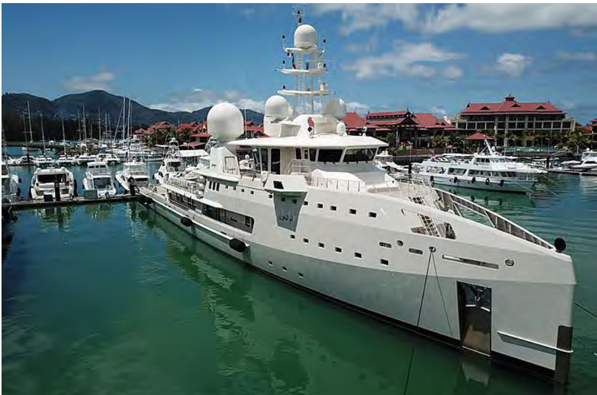
Al Adaam (2013)

CUSTOMER: Cyrus Yachts Antalya TYPE: Sailing Yacht (22 m) TYPE OF WORK: Newbuild SCOPE OF SUPPLY: Electrical Package Delivery