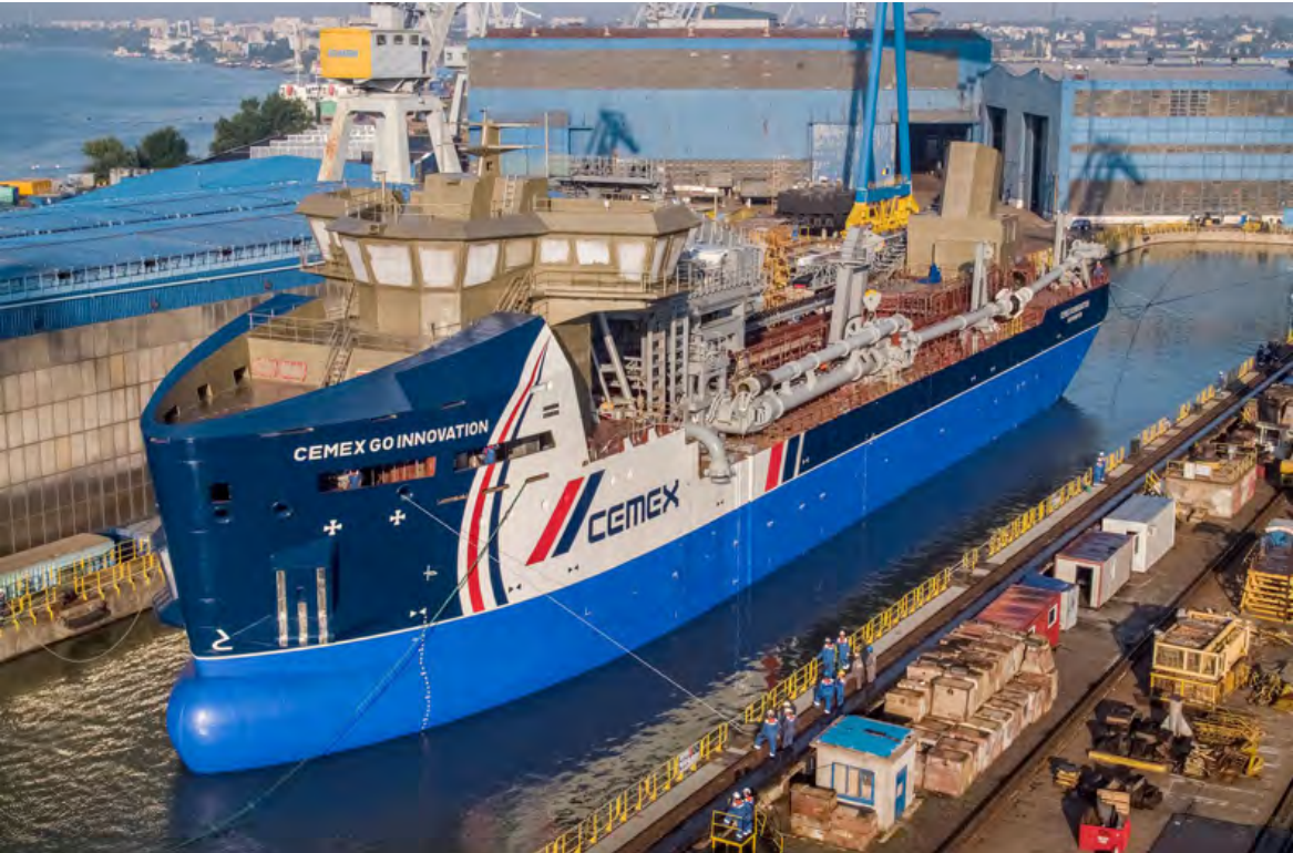
CEMEX Go Innovation (2019)

CUSTOMER: Thecla Bodewes Shipyards TYPE: Trailing Suction Hopper Dredger (3000 m³) TYPE OF WORK: Newbuild SCOPE OF SUPPLY: Electrical Installation and Automation Systems