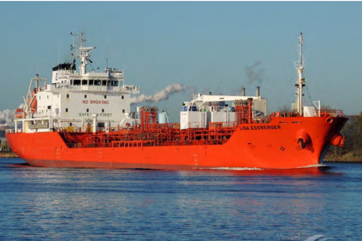
Essberger vessels: Lisa, Lucy, Caroline, Ursula, Anneliese and Wilhelmine (2016)

CUSTOMER: Various shipyards TYPE: Chemical sea tankers TYPE OF WORK: Newbuild SCOPE OF SUPPLY: Service.