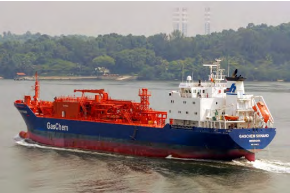
GasChem Shinano, Mosel, Leda, Rhone, Werra, Balti, Atlanti, Arcti, Caribic (2004-2021)

CUSTOMER: Severnav Shipyard TYPE: 6500 m 3 liquefied gas tanker and 8600 m 3 gas tankers TYPE OF WORK: Newbuild SCOPE OF SUPPLY: Complete electrical package, including engineering, commissioning, alarm, monitoring and control systems.