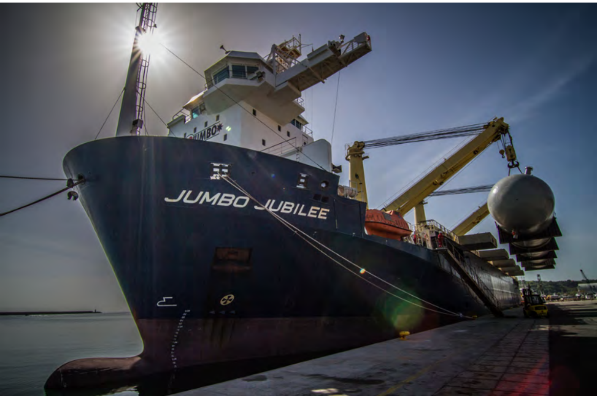
Jumbo Jubilee (2019)

CUSTOMER: Jumbo Maritime TYPE: Heavy Load Carrier (144 m) TYPE OF WORK: Service SCOPE OF SUPPLY: Engineering, production of additional distribution for 6 additional generators. Including modifications to AMCS and PMS.