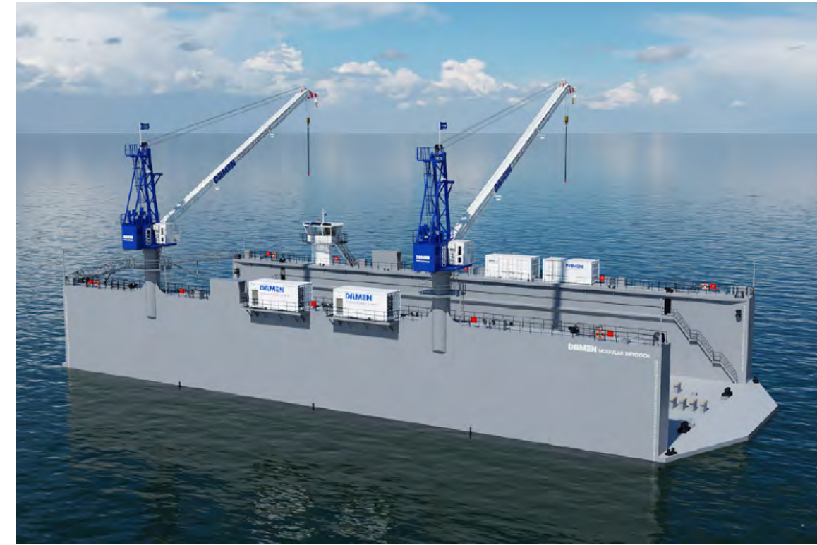
Modular Dry Dock 8026-4 (2017)

CUSTOMER: Damen Galati TYPE: Service Operation Vessel (89,65 m) TYPE OF WORK: Newbuild SCOPE OF SUPPLY: System Integration, complete electrical installation.