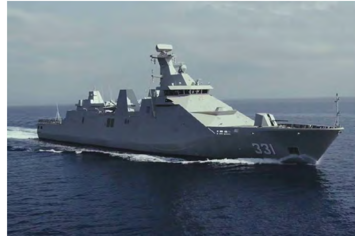
Gusti Ngurah Ra (2017)

CUSTOMER: Damen Schelde Naval Shipbuilding TYPE: Guided-missile Frigate (105,1 m) TYPE OF WORK: Newbuild SCOPE OF SUPPLY: Engineering and integration of platform system, materials and equipment/ system delivery, installing of cable and set to work activities.