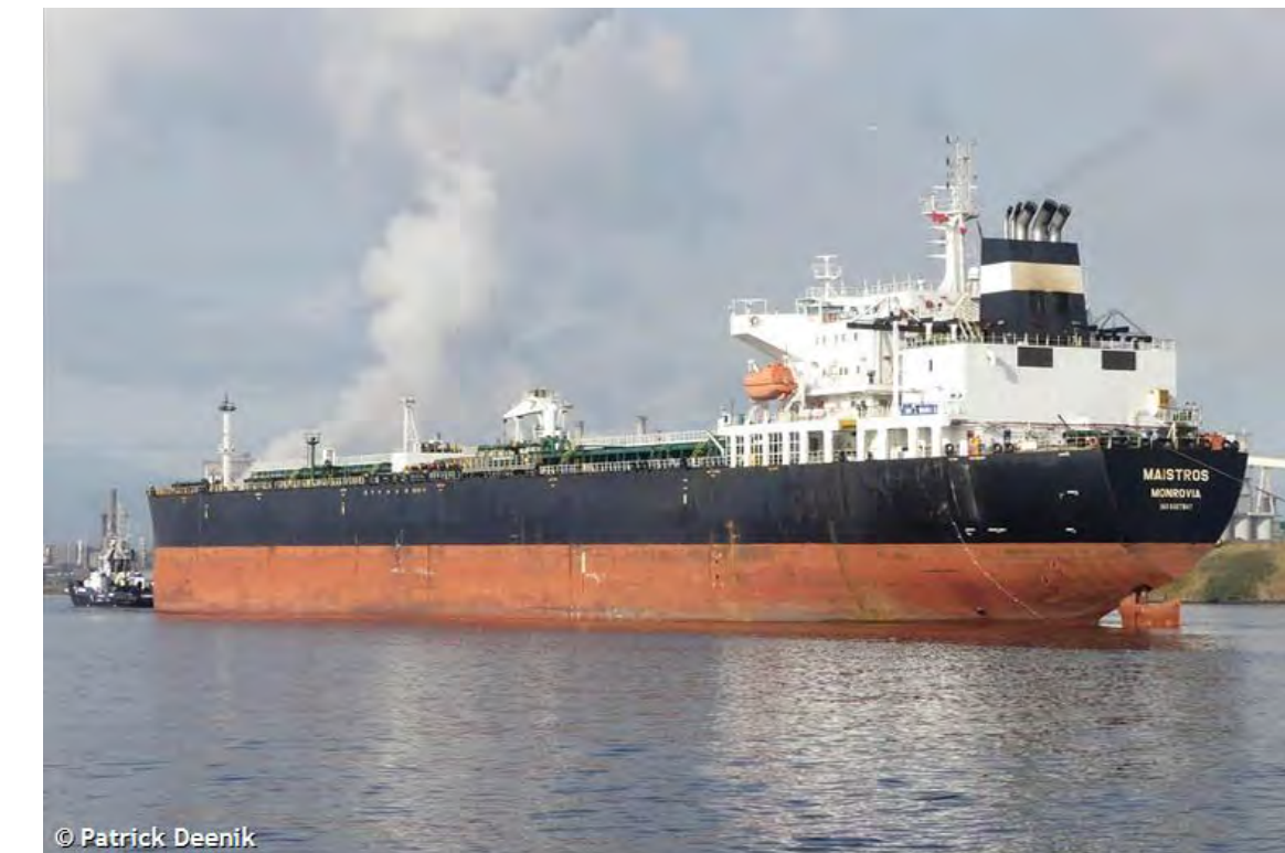
Maistros & Ostria (2007-2008)

CUSTOMER: Damen Shipyards Gorinchem TYPE: stan tanker 5412 TYPE OF WORK: Newbuild SCOPE OF SUPPLY: Complete electrical package (engineering, installing, commissioning, alarm, monitoring and control systems, internal communication systems, CCTV system).