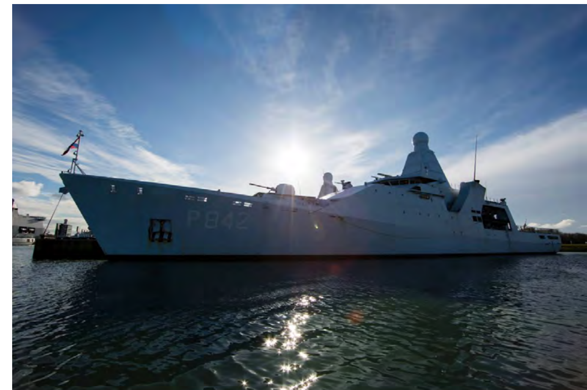
Zr. Ms. Friesland (2013)

CUSTOMER: Damen Schelde Naval Shipbuilding TYPE: Offshore Patrol Vessel (108,4 m) TYPE OF WORK: Newbuild SCOPE OF SUPPLY: Complete electrical systems integration, installing, supervising on site and commissioning.