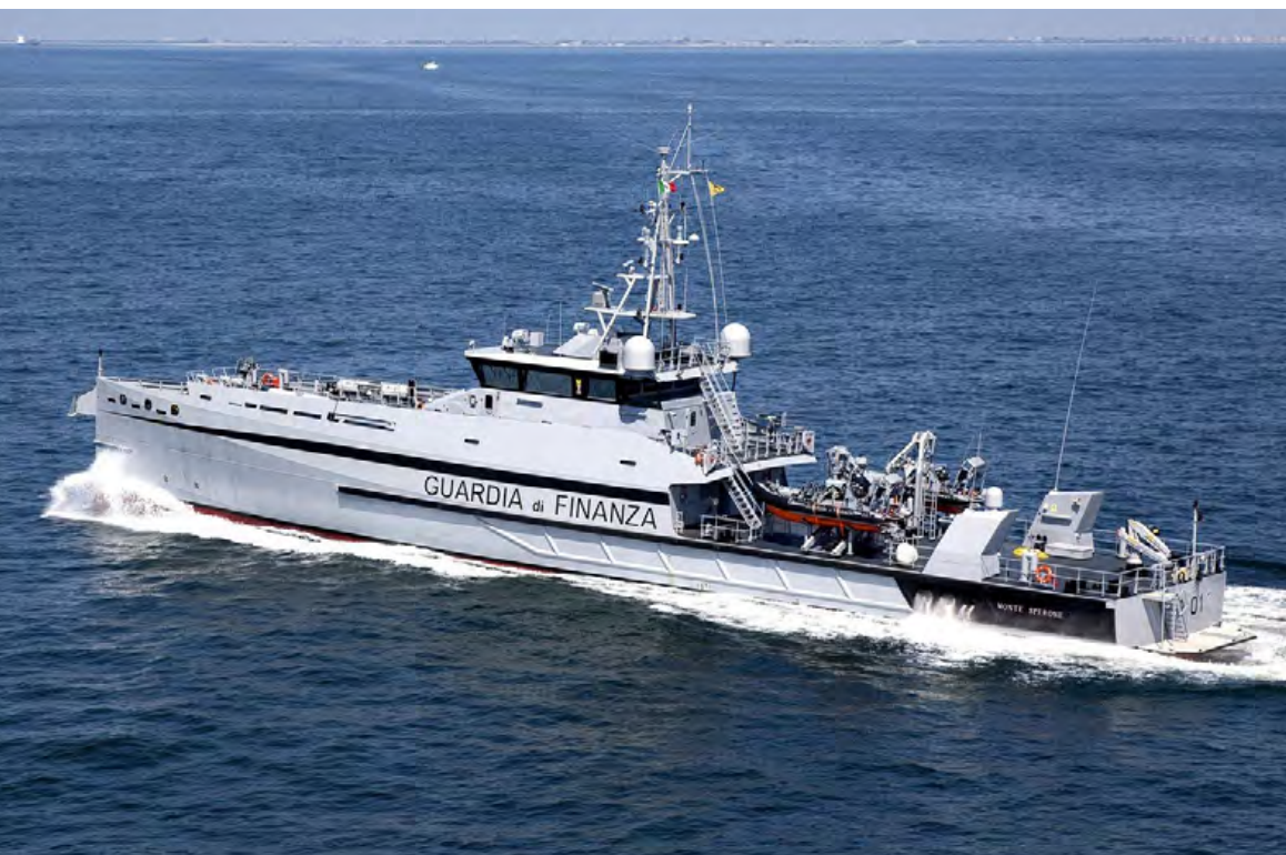
Stan Patrol 5509 (2015)

CUSTOMER: Damen Schelde Naval Shipbuilding TYPE: Guided-missile Frigate (105,1 m) TYPE OF WORK: Newbuild SCOPE OF SUPPLY: Engineering and integration of platform system, materials and equipment/ system delivery, installing of cable and set to work activities.