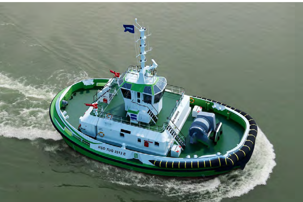
RSD2513 YN515011-16 (2020)

CUSTOMER: Damen Shipyards Gorinchem TYPE: Tug boat (23 m) TYPE OF WORK: Newbuild SCOPE OF SUPPLY: Switchboards and consoles