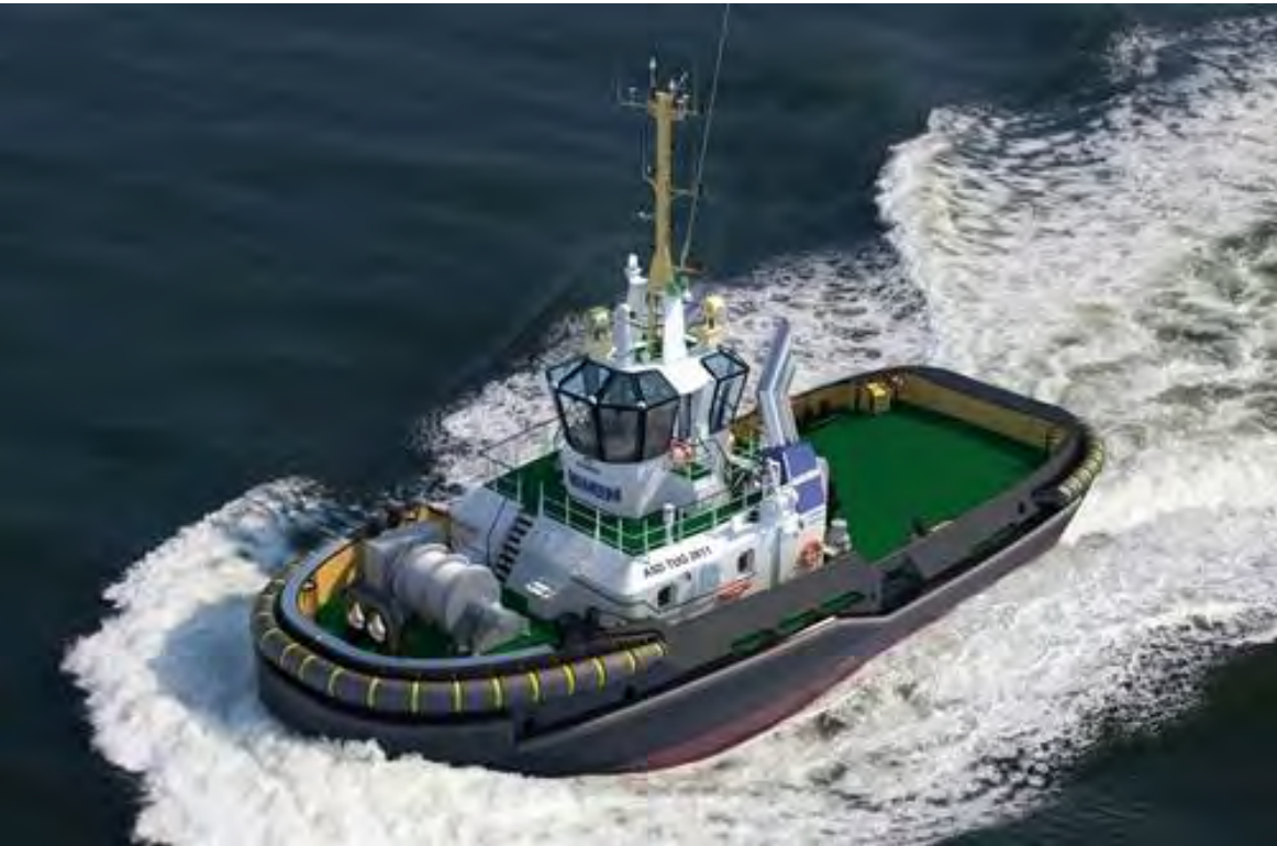
ASD2811 YN513213-14 (2020)

CUSTOMER: Damen Shipyards Gorinchem TYPE: Tug boat (28 m) TYPE OF WORK: Newbuild SCOPE OF SUPPLY: Switchboards and consoles