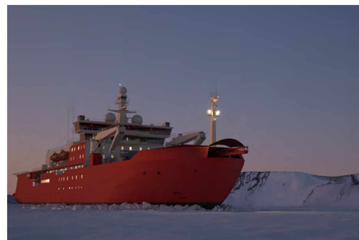
RSV Nuyina (2020)

CUSTOMER: Damen Shipyards Gorinchem TYPE: Offshore Patrol Vessel (67 m) TYPE OF WORK: Newbuild SCOPE OF SUPPLY: Electrical package delivery. Engineering, installing and commissioning.