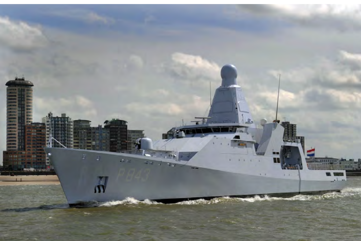
Zr. Ms. Groningen (2013)

CUSTOMER: Damen Schelde Naval Shipbuilding TYPE: Offshore Patrol Vessel (108,4 m) TYPE OF WORK: Newbuild SCOPE OF SUPPLY: Complete electrical systems integration, installing, supervising on site and commissioning.