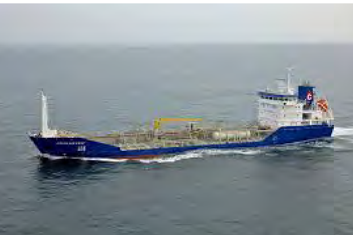
Coolwater and Capewater (2008)

CUSTOMER: Various shipyards TYPE: Chemical sea tankers TYPE OF WORK: Newbuild SCOPE OF SUPPLY: Service.