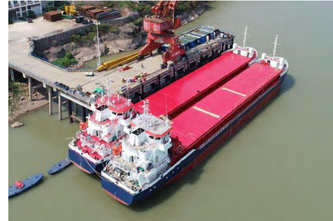
Combi Freighter 3850m 2 (2019)

CUSTOMER: Royal Bodewes TYPE: LNG-Tanker TYPE OF WORK: Newbuild SCOPE OF SUPPLY: Engineering, installation and commissioning of complete electrical installation, including emergency shutdown system, alarm, monitoring and control systems, power management system, electrical distribution systems, drives