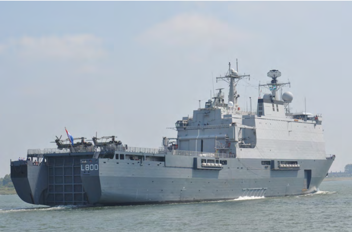
Zr. Ms. Rotterdam (2019)

CUSTOMER: R+S TYPE: Hydrografic Research Vessel (80 m) TYPE OF WORK: Refit SCOPE OF SUPPLY: Modifications PABX.