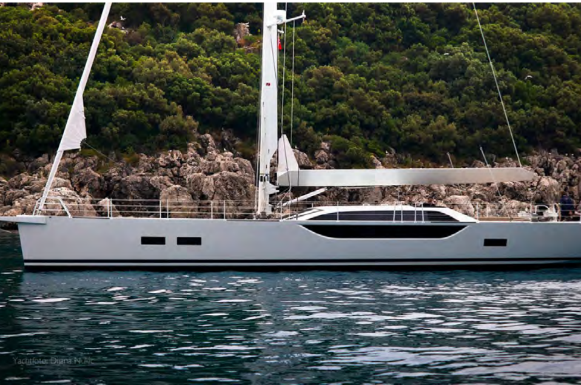
Bliss II (2014)

CUSTOMER: Cyrus Yachts Antalya TYPE: Sailing Yacht (22 m) TYPE OF WORK: Newbuild SCOPE OF SUPPLY: Electrical Package Delivery