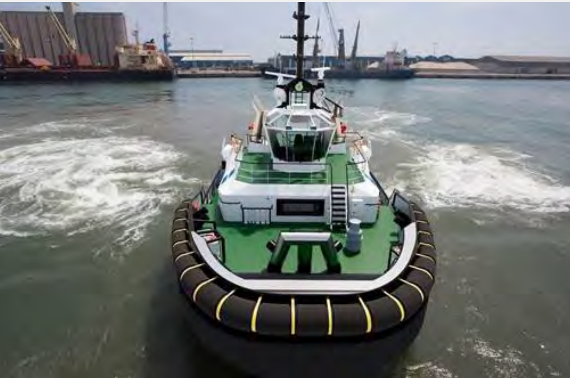
ASD2312 YN513605-10 (2020)

CUSTOMER: Damen Shipyards Gorinchem TYPE: Tug boat (28 m) TYPE OF WORK: Newbuild SCOPE OF SUPPLY: Switchboards and consoles.