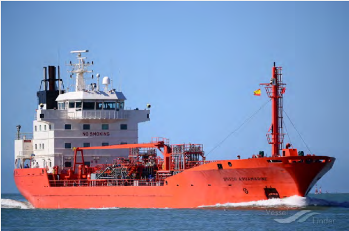
Dutch Aqua Marine (2000)

CUSTOMER: VEKA Shipyard Lemmer TYPE: Chemical oil product tanker TYPE OF WORK: Newbuild SCOPE OF SUPPLY: Engineering, installation and commissioning of complete electrical installation, including alarm, monitoring and control systems, electrical distribution systems, power management system.