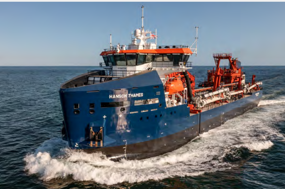
Hanson Thames, YN 563352 (2021)

CUSTOMER: Damen Shipyards Gorinchem, Galați TYPE: Marine Agregate Dredger 3500 (103 m) TYPE OF WORK: Newbuild SCOPE OF SUPPLY: Complete electrical engineering, cables & equipment delivery, complete installing and commissioning works for shaft generators, power management and power distribution system, alarm monitoring and control system, dredging control system, fire detection system, motor starters, etc.