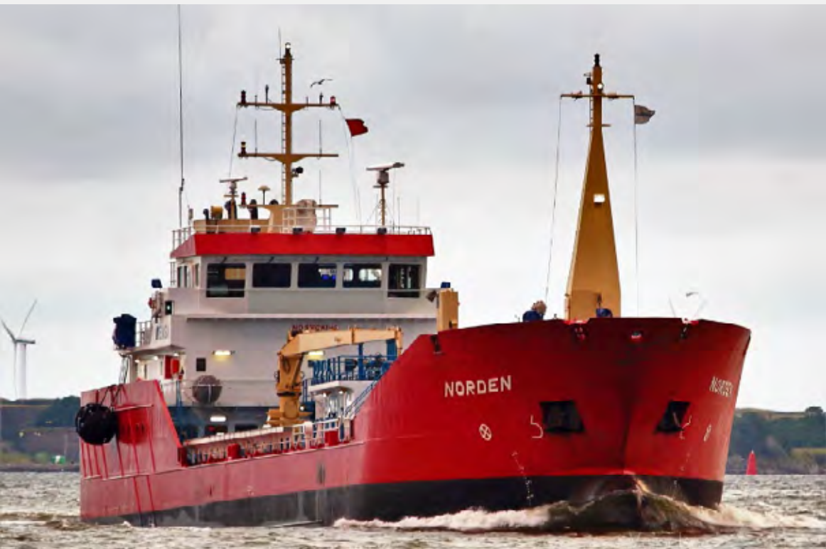
MT Norden (2006)

CUSTOMER: Bodewes Shipyards Hoogezand TYPE: 2.850 m³ oil tanker TYPE OF WORK: Newbuild SCOPE OF SUPPLY: Engineering, installation and commissioning of complete electrical installation, including alarm, monitoring and control systems, electrical distribution systems.