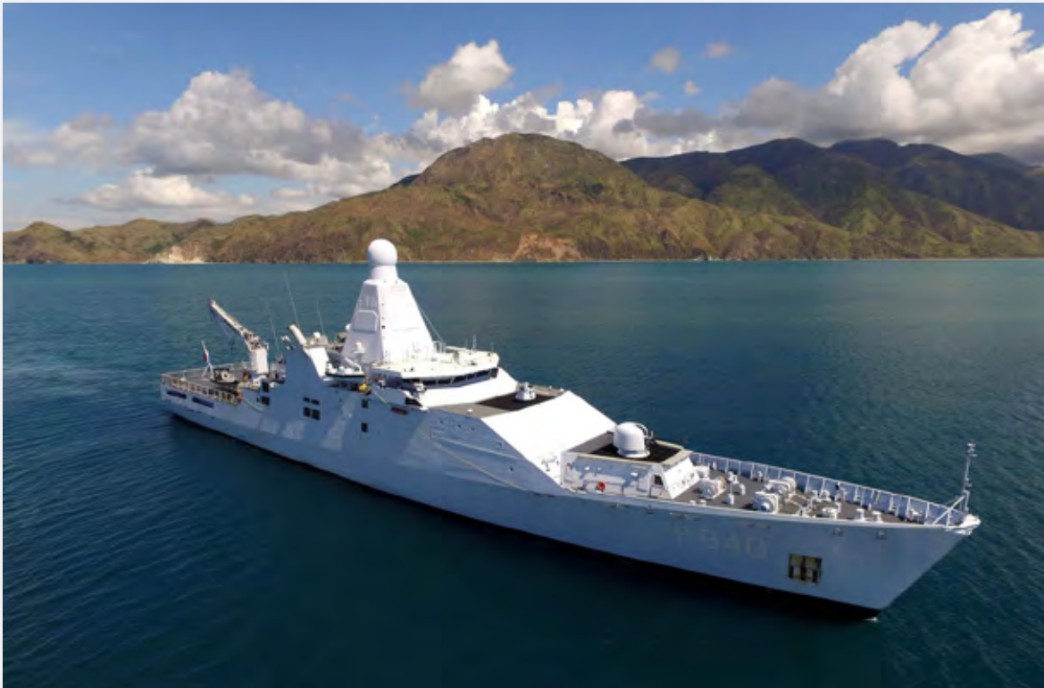
Zr. Ms. Holland (2012)

CUSTOMER: Damen Schelde Naval Shipbuilding TYPE: Offshore Patrol Vessel (108.4 m) TYPE OF WORK: Newbuild SCOPE OF SUPPLY: Complete electrical systems integration, installing, supervising on site and commissioning.