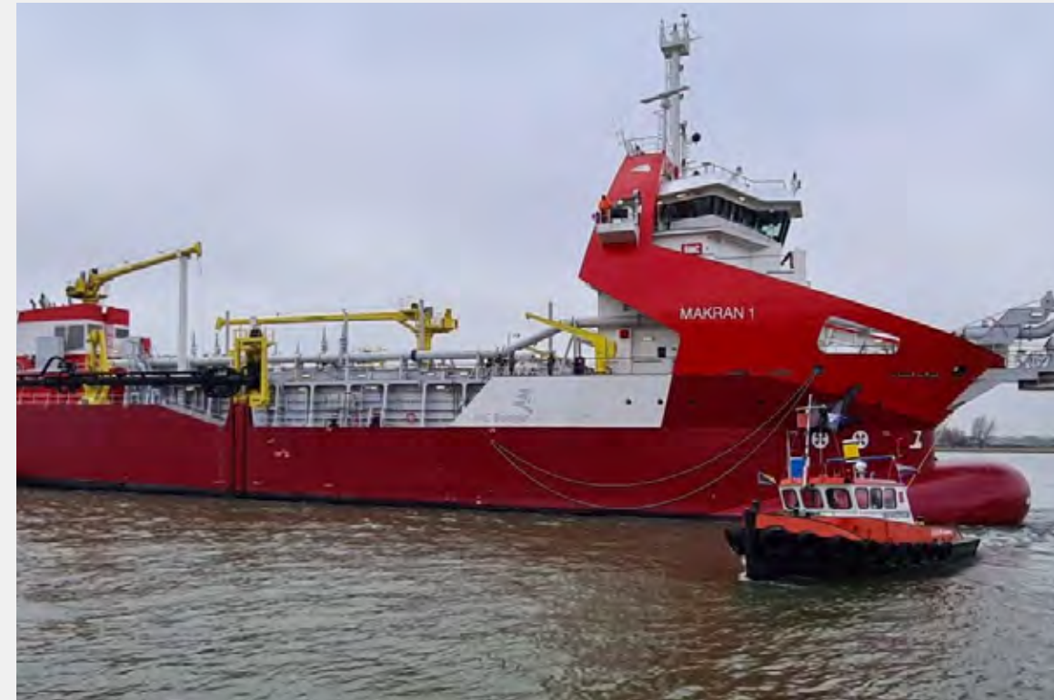
Makran 1&2, YN1301/02 (2021)

CUSTOMER: Damen Shipyards Gorinchem, Galați TYPE: Marine Agregate Dredger 3500 (103 m) TYPE OF WORK: Newbuild SCOPE OF SUPPLY: Complete electrical engineering, cables & equipment delivery, complete installing and commissioning works for shaft generators, power management and power distribution system, alarm monitoring and control system, dredging control system, fire detection system, motor starters, etc.