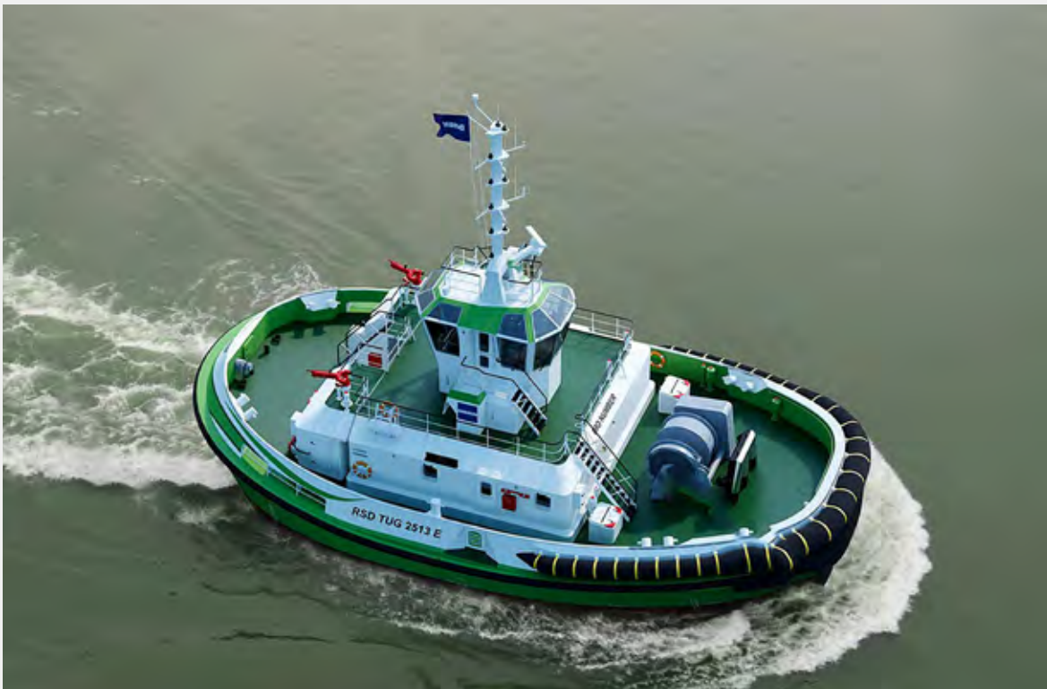
RSD2513 YN515011-16 (2020)

CUSTOMER: Damen Shipyards Gorinchem TYPE: Tug boat (23 m) TYPE OF WORK: Newbuild SCOPE OF SUPPLY: Switchboards and consoles.