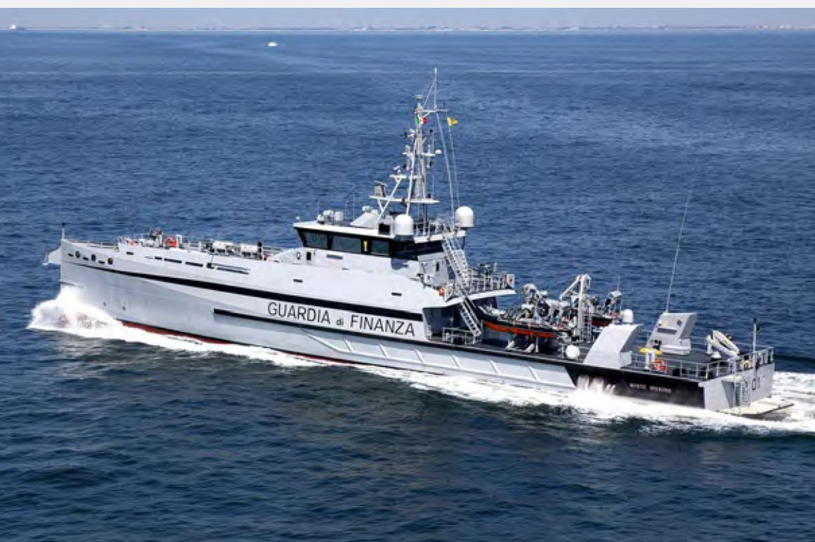
Stan Patrol 5509 (2015)

CUSTOMER: Damen Shiprepair Dunkerque TYPE: Research Vessel (50.9 m) TYPE OF WORK: Refit SCOPE OF SUPPLY: Life time extension. Electrical Installation.