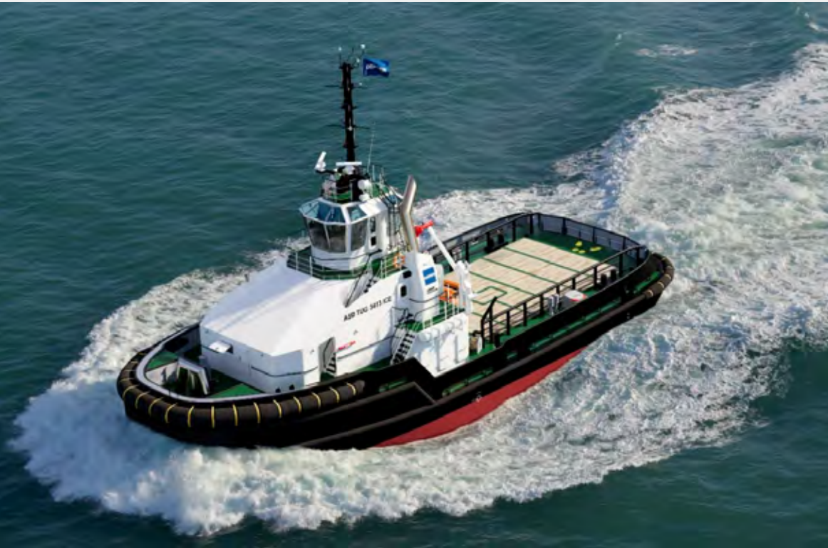
ASD 3413 YN 512801 (2021)

CUSTOMER: Damen Shipyards Gorinchem TYPE: Ice Tug(34 m) TYPE OF WORK: Newbuild SCOPE OF SUPPLY: Switchboards