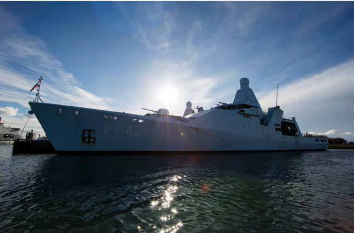
Zr. Ms. Friesland (2013)

CUSTOMER: Damen Schelde Naval Shipbuilding TYPE: Offshore Patrol Vessel (108.4 m) TYPE OF WORK: Newbuild SCOPE OF SUPPLY: Complete electrical systems integration, installing, supervising on site and commissioning.