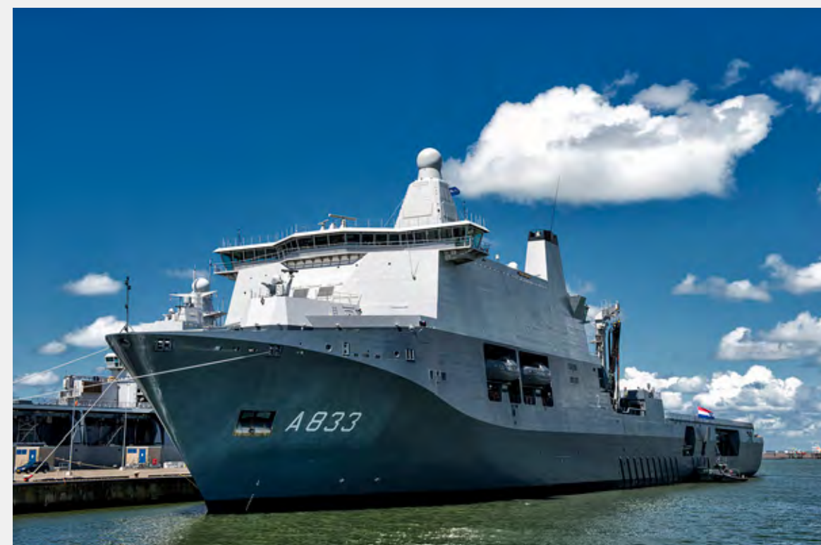
Zr. Ms. Karel Doorman (2015)

CUSTOMER: Damen Shipyards Gorinchem TYPE: Offshore Patrol Vessel (55 m) TYPE OF WORK: Newbuild SCOPE OF SUPPLY: Electrical package delivery. Engineering, installing and commissioning.