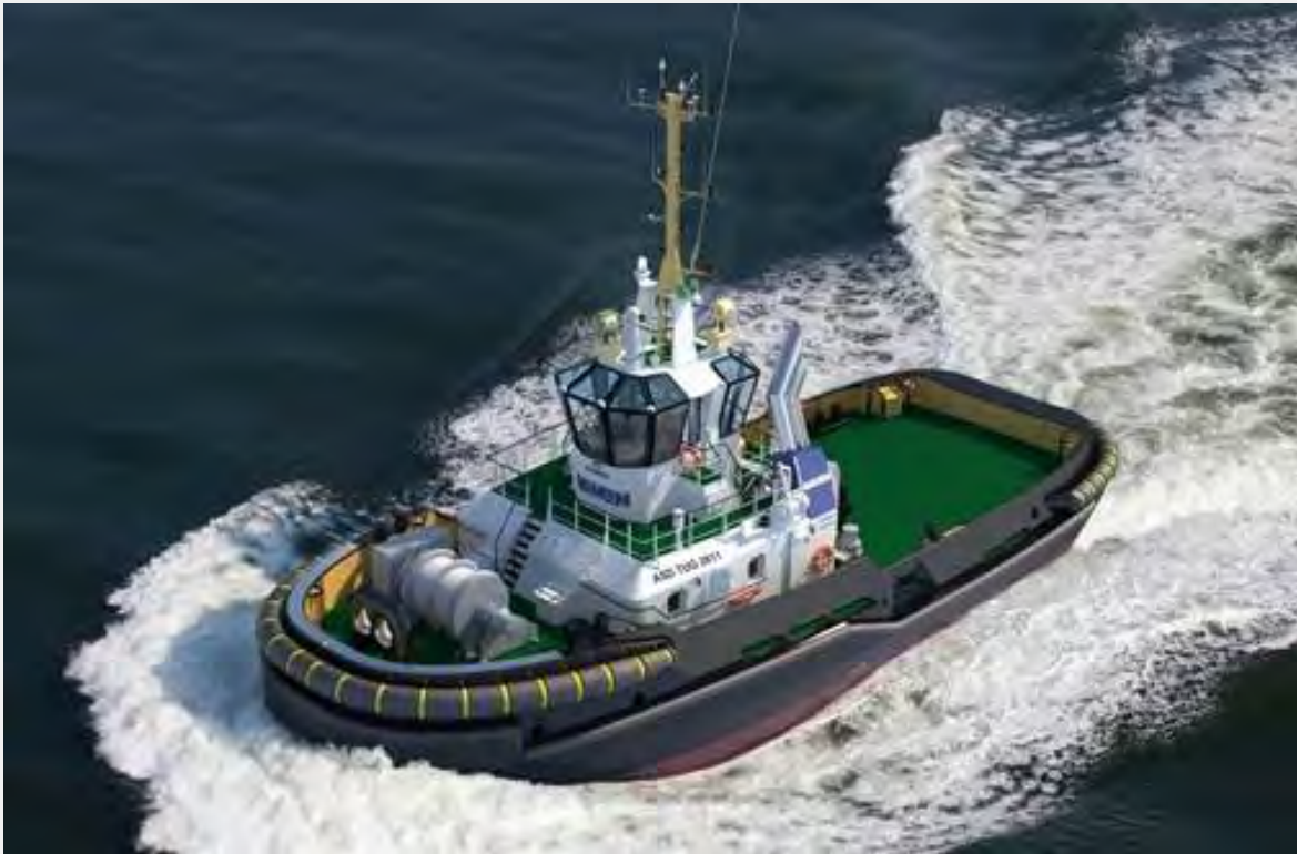
ASD2811 YN513213-14 (2020)

CUSTOMER: Damen Shipyards Gorinchem TYPE: Ice Tug(34 m) TYPE OF WORK: Newbuild SCOPE OF SUPPLY: Switchboards