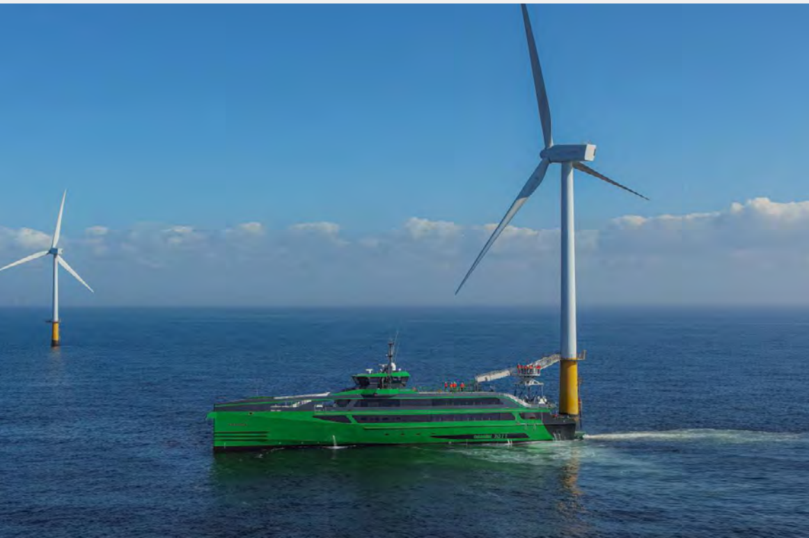
Aqua Helix (2022)

CUSTOMER: McDermott TYPE: Pipe layer (142 m) TYPE OF WORK: Refit SCOPE OF SUPPLY: Conversion to pipe-lay vessel.