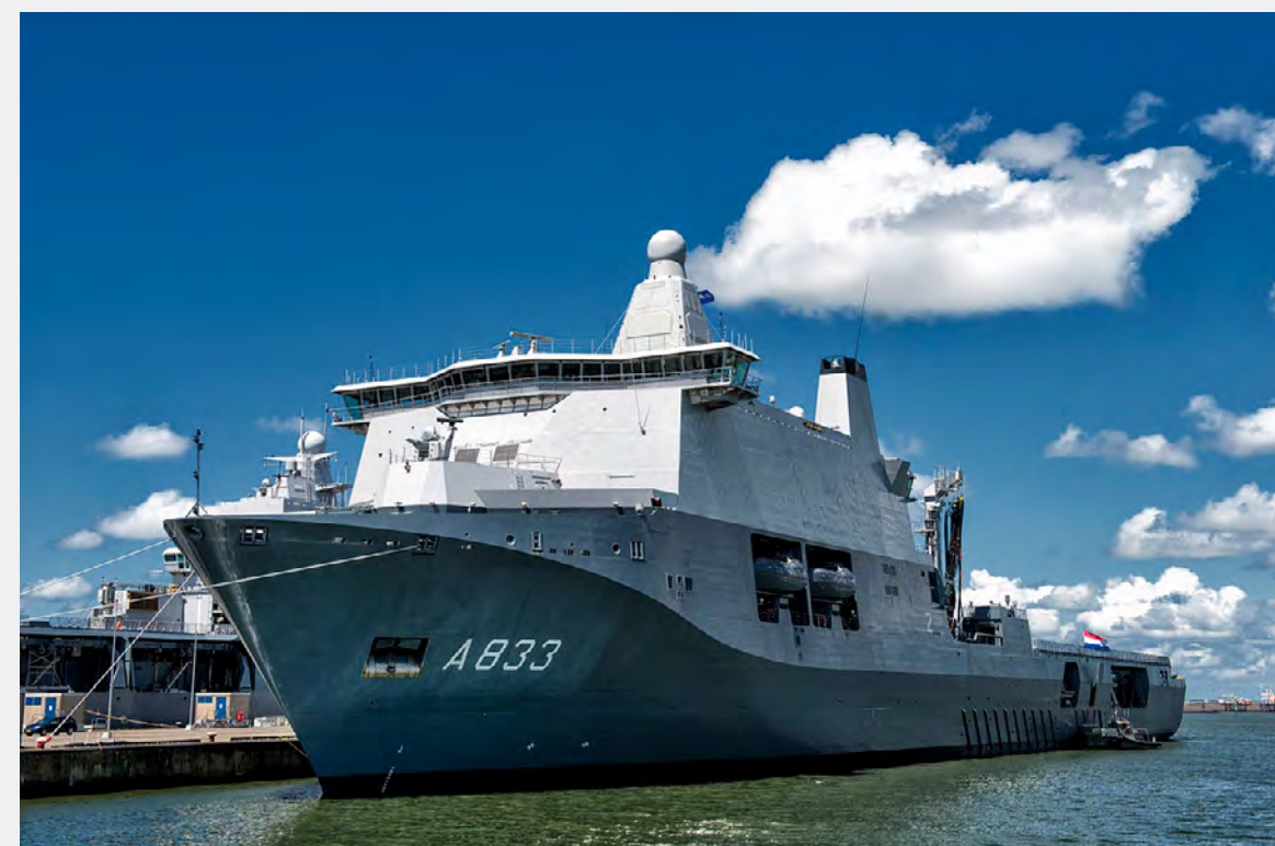
Zr. Ms. Karel Doorman (2015)

CUSTOMER: Damen Shipyards Gorinchem TYPE: Offshore Patrol Vessel (55 m) TYPE OF WORK: Newbuild SCOPE OF SUPPLY: Electrical package delivery. Engineering, installing and commissioning.