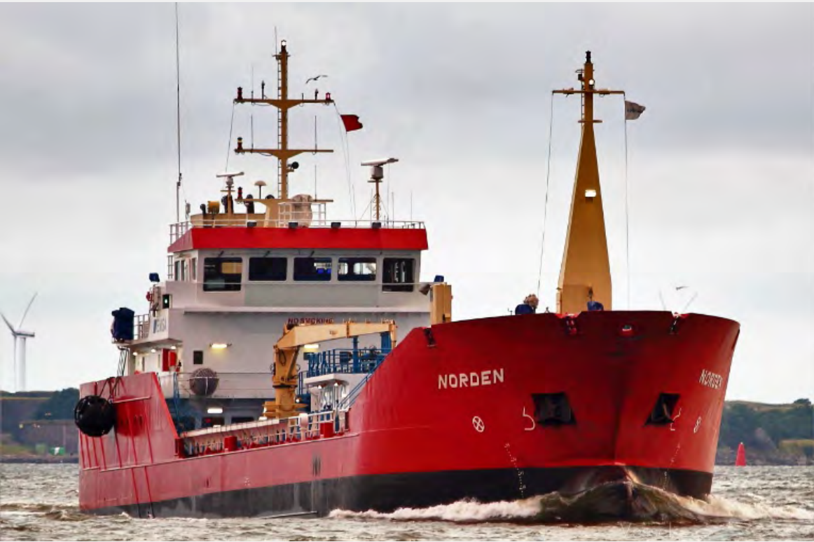
MT Norden (2006)

CUSTOMER: Bodewes Shipyards Hoogezand TYPE: 2.850 m³ oil tanker TYPE OF WORK: Newbuild SCOPE OF SUPPLY: Engineering, installation and commissioning of complete electrical installation, including alarm, monitoring and control systems, electrical distribution systems.