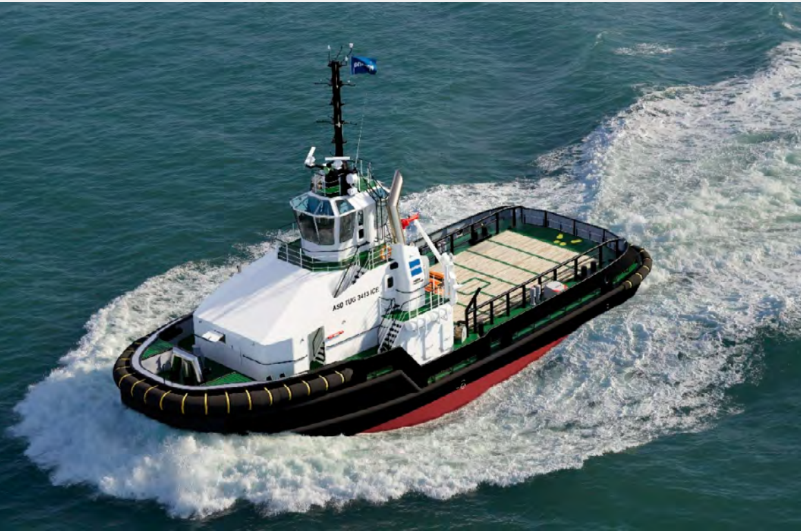
ASD 3413 YN 512801 (2021)

CUSTOMER: Damen Shipyards Gorinchem TYPE: Ice Tug(34 m) TYPE OF WORK: Newbuild SCOPE OF SUPPLY: Switchboards