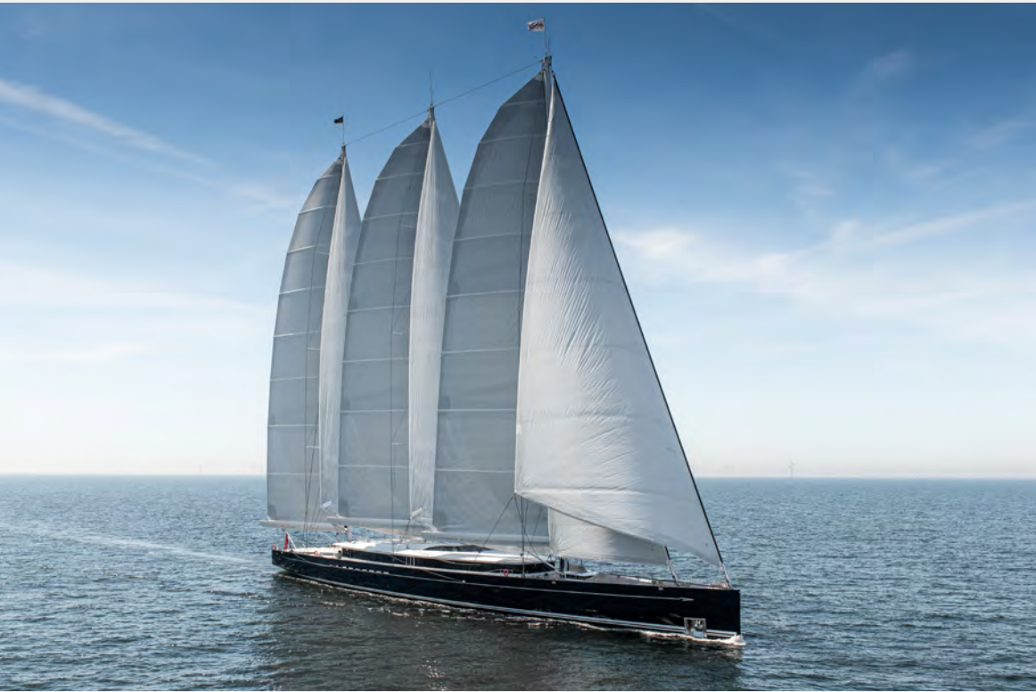
Sea Eagle II (2020)

CUSTOMER: Royal Huisman TYPE: Sailing Yacht (80 m) TYPE OF WORK: Newbuild SCOPE OF SUPPLY: Entertainment system and Main switchboard.