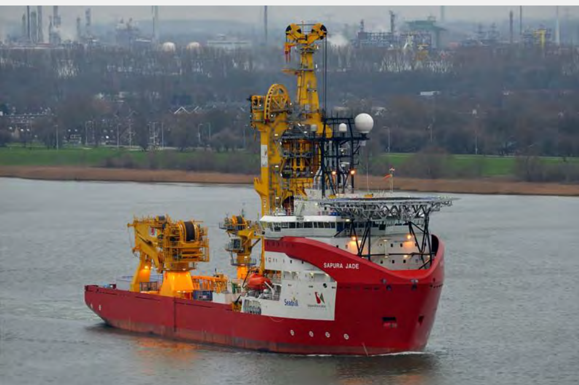
Sapura Jade (2016)

CUSTOMER: Damen Galați TYPE: Cable Layer (138 m) TYPE OF WORK: Newbuild SCOPE OF SUPPLY: System Integration, complete electrical installation; alarm, monitoring and control system; power distribution system.