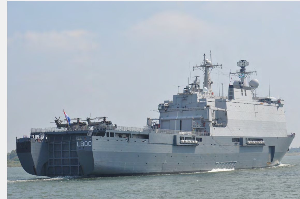
Zr. Ms. Rotterdam (2019)

CUSTOMER: R+S TYPE: Hydrografic Research Vessel (80 m) TYPE OF WORK: Refit SCOPE OF SUPPLY: Modifications PABX.