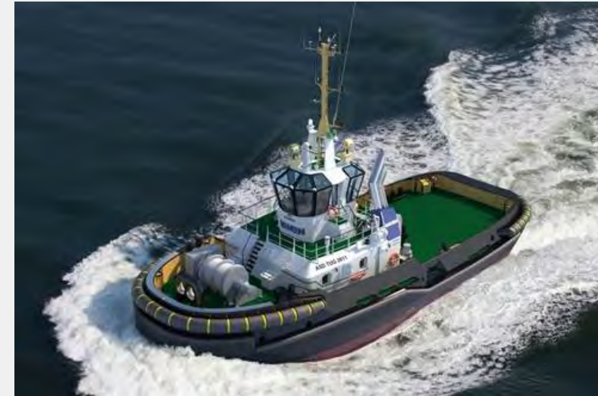
ASD2811 YN513213-14 (2020)

CUSTOMER: Damen Shipyards Gorinchem TYPE: Ice Tug(34 m) TYPE OF WORK: Newbuild SCOPE OF SUPPLY: Switchboards