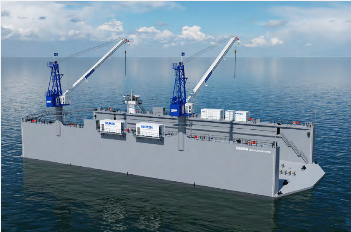
Modular Dry Dock 8026-4 (2017)

CUSTOMER: DEME TYPE: Cable Layer (161 m) TYPE OF WORK: Refit SCOPE OF SUPPLY: Infrastructure (cable routing, cable trays).