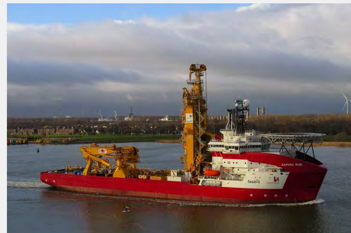
Sapura Rubi (2016)

CUSTOMER: IHC Offshore & Marine TYPE: Pipe Laying Support Vessel (145.9 m) TYPE OF WORK: Newbuild SCOPE OF SUPPLY: System Integration, complete electrical installation.