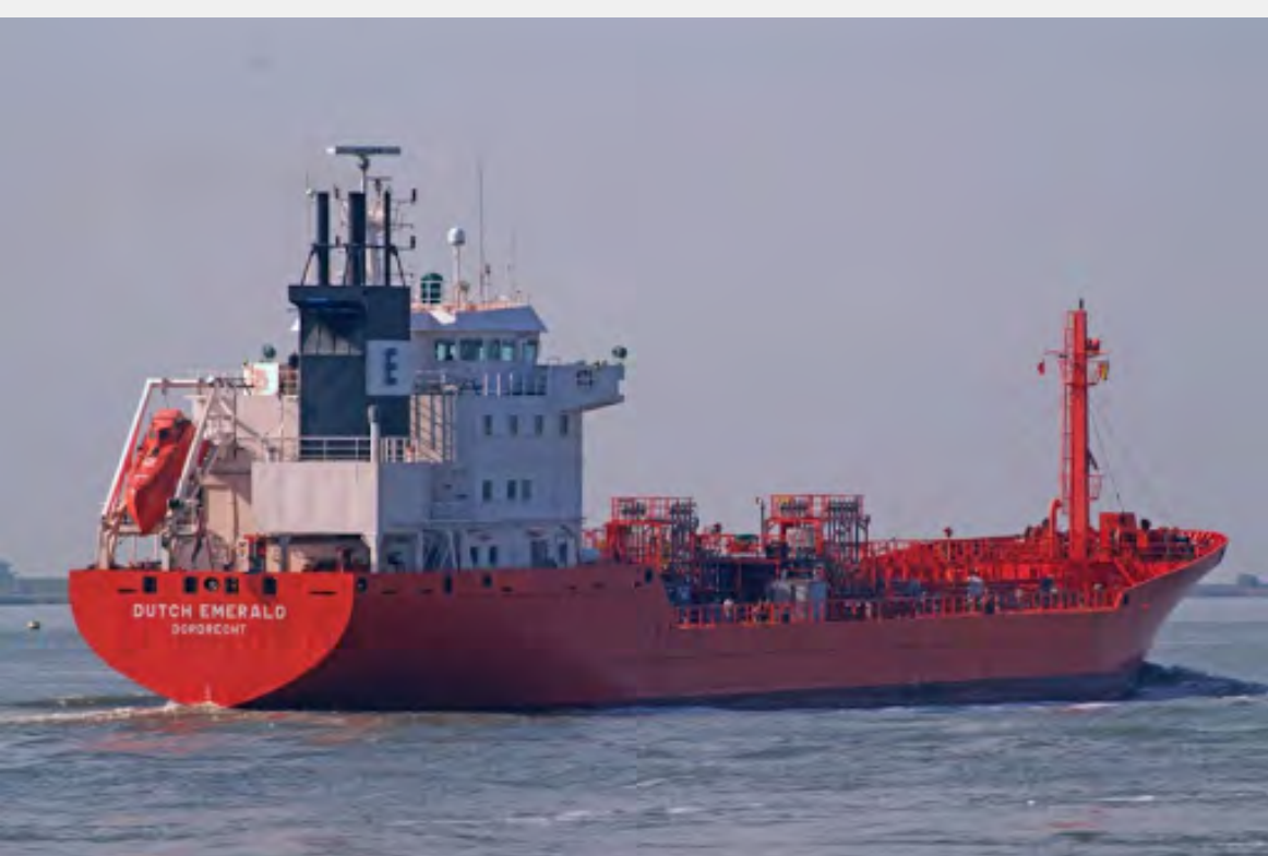
Dutch Emerald (2000)

CUSTOMER: VEKA Shipyard Lemmer TYPE: chemical tanker TYPE OF WORK: Newbuild SCOPE OF SUPPLY: Engineering, installation and commissioning of complete electrical installation, including alarm, monitoring and control systems, electrical distribution systems.