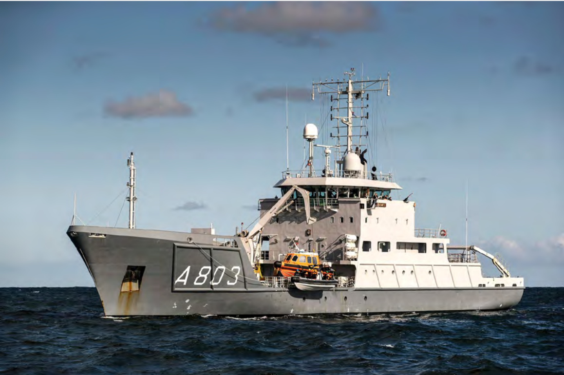
Zr. Ms. Luymes (2020)

CUSTOMER: R+S TYPE: Hydrografic Research Vessel (80 m) TYPE OF WORK: Refit SCOPE OF SUPPLY: Modifications PABX.