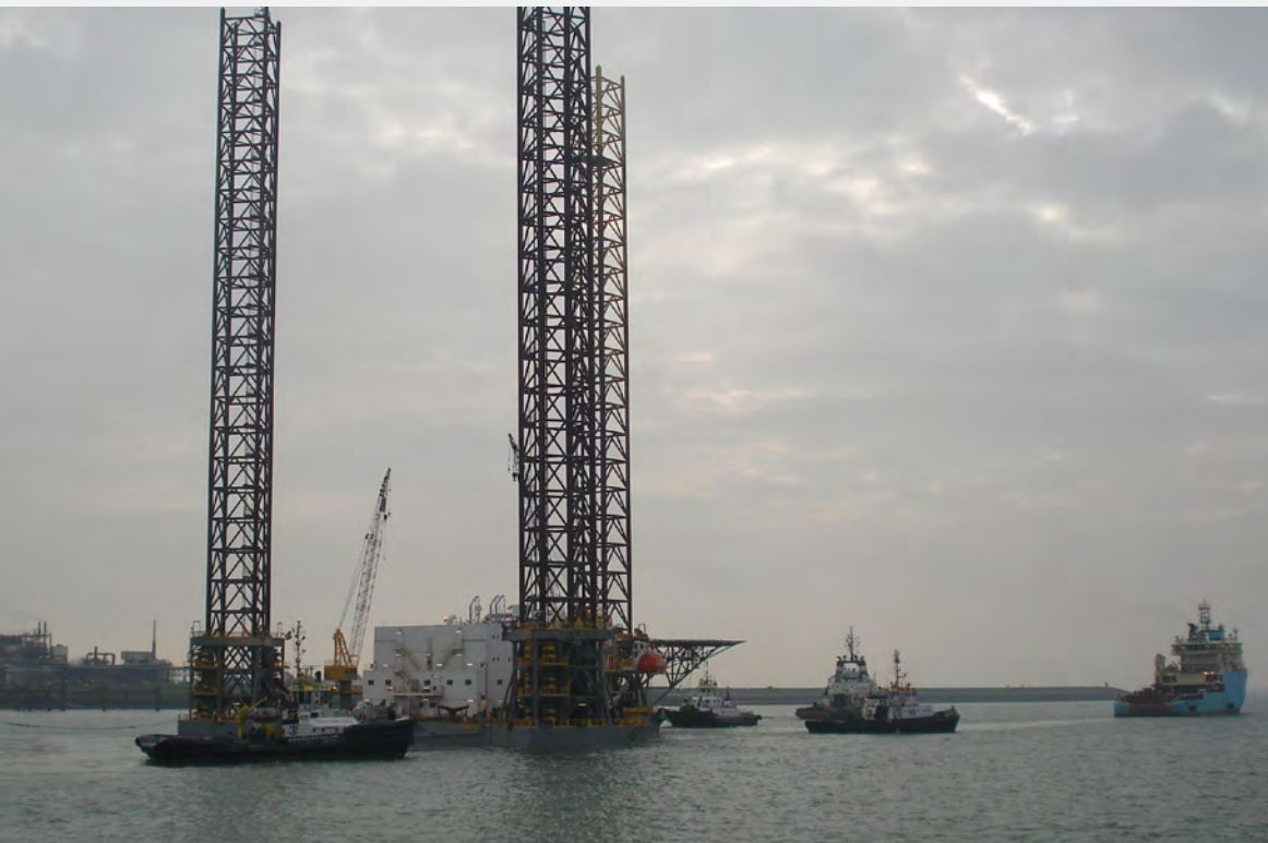
Atlantic Labrador (2012)

CUSTOMER: AMS TYPE: Accommodation Jack-Up Platform (74 m) TYPE OF WORK: Refit SCOPE OF SUPPLY: Conversion to accommodation platform.