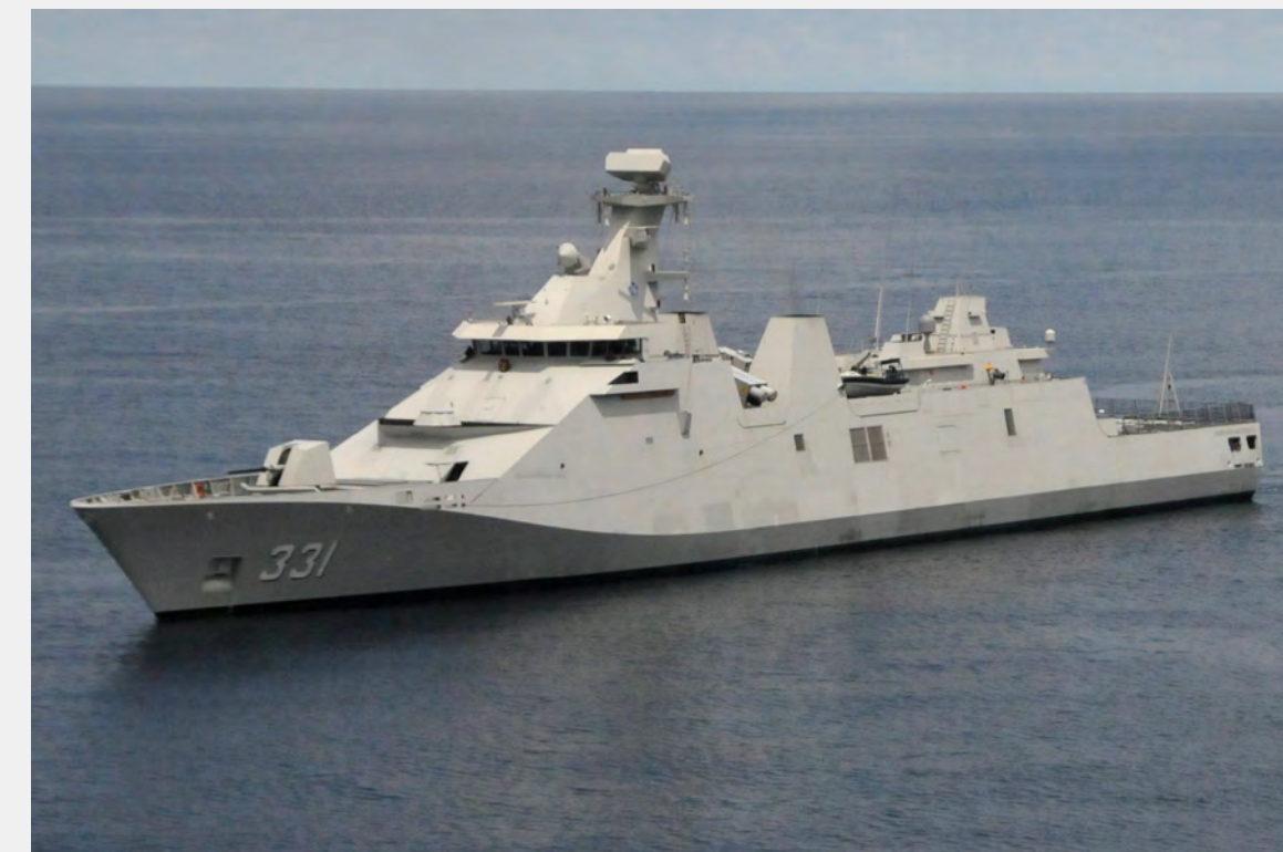
KRI Raden Eddy Martadinata (2017)

CUSTOMER: Damen Shiprepair Vlissingen TYPE: Research Vessel (60 m) TYPE OF WORK: Refit SCOPE OF SUPPLY: Life time extension. Electrical Installation and Nautical System.