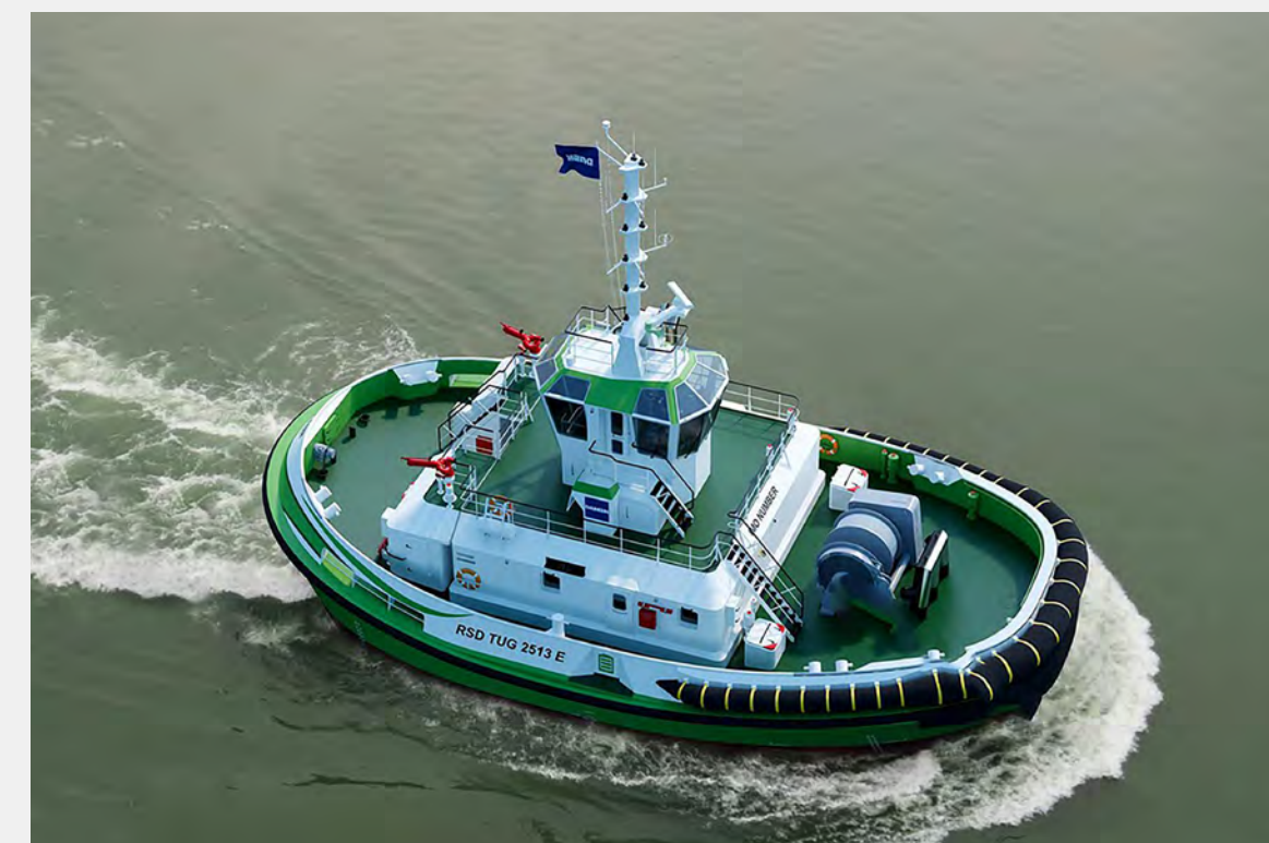
RSD2513 YN515011-16 (2020)

CUSTOMER: Damen Shipyards Gorinchem TYPE: Tug boat (23 m) TYPE OF WORK: Newbuild SCOPE OF SUPPLY: Switchboards and consoles.