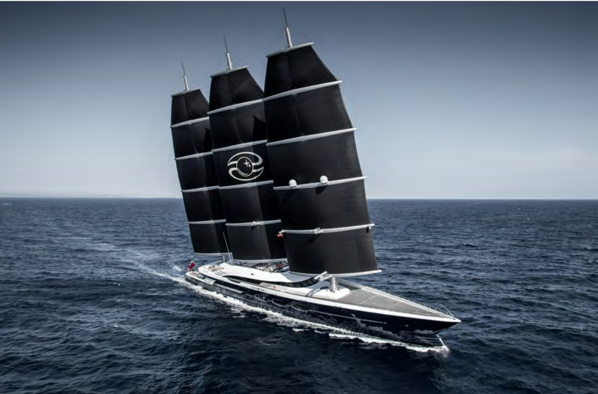
Black Pearl (2018)

CUSTOMER: Oceanco TYPE: Sailing Yacht (106.7 m) TYPE OF WORK: Newbuild SCOPE OF SUPPLY: System integration and complete electrical installation, hybrid system.