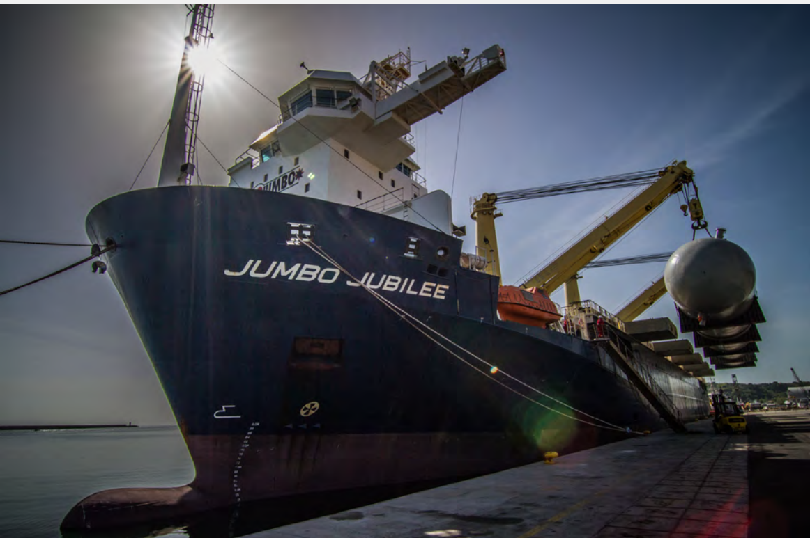
Jumbo Jubilee (2019)

CUSTOMER: Jumbo Maritime TYPE: Heavy Load Carrier (145 m) TYPE OF WORK: Service SCOPE OF SUPPLY: Power distribution system.