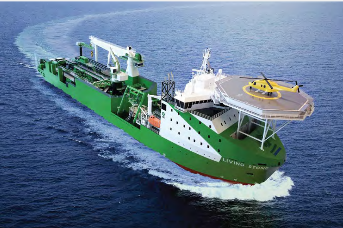
Living Stone (2018)

CUSTOMER: DEME TYPE: Jack-Up Vessel (89 m) TYPE OF WORK: Newbuild SCOPE OF SUPPLY: Vessel management system comprising power management, tank sounding, draught & loading system (ADLS) and secondary systems; KVM matrix solution for high level integrated bridges; installation helideck; ATEX inspection.