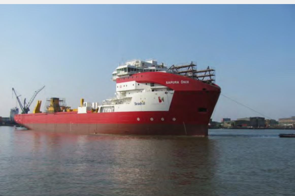
Sapura Onix (2015)

CUSTOMER: IHC Offshore & Marine TYPE: Pipe Laying Support Vessel (145 m) TYPE OF WORK: Newbuild SCOPE OF SUPPLY: System Integration, complete electrical installation.