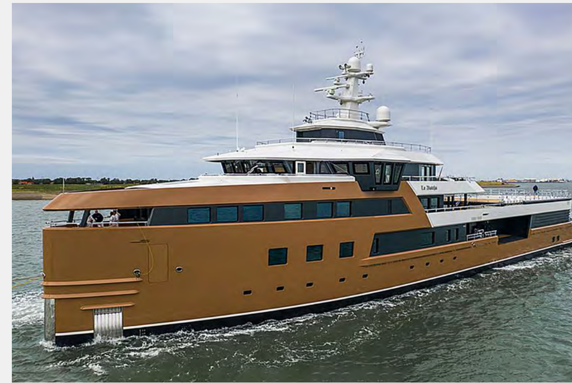
La Datcha (2020)

CUSTOMER: Royal Huisman TYPE: Sailing Yacht (80 m) TYPE OF WORK: Newbuild SCOPE OF SUPPLY: Entertainment system and Main switchboard.