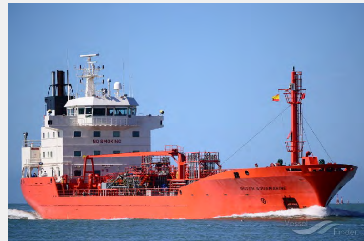
Dutch Aqua Marine (2000)

CUSTOMER: VEKA Shipyard Lemmer TYPE: Chemical oil product tanker TYPE OF WORK: Newbuild SCOPE OF SUPPLY: Engineering, installation and commissioning of complete electrical installation, including alarm, monitoring and control systems, electrical distribution systems, power management system.