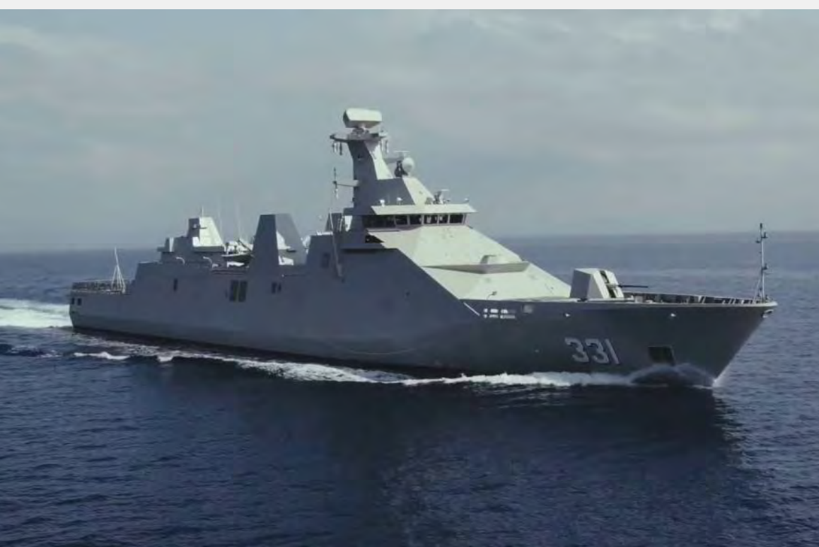
Gusti Ngurah Ra (2017)

CUSTOMER: Damen Schelde Naval Shipbuilding TYPE: Guided-missile Frigate (105.1 m) TYPE OF WORK: Newbuild SCOPE OF SUPPLY: Engineering and integration of platform system, materials and equipment/system delivery, installing of cable and set to work activities.