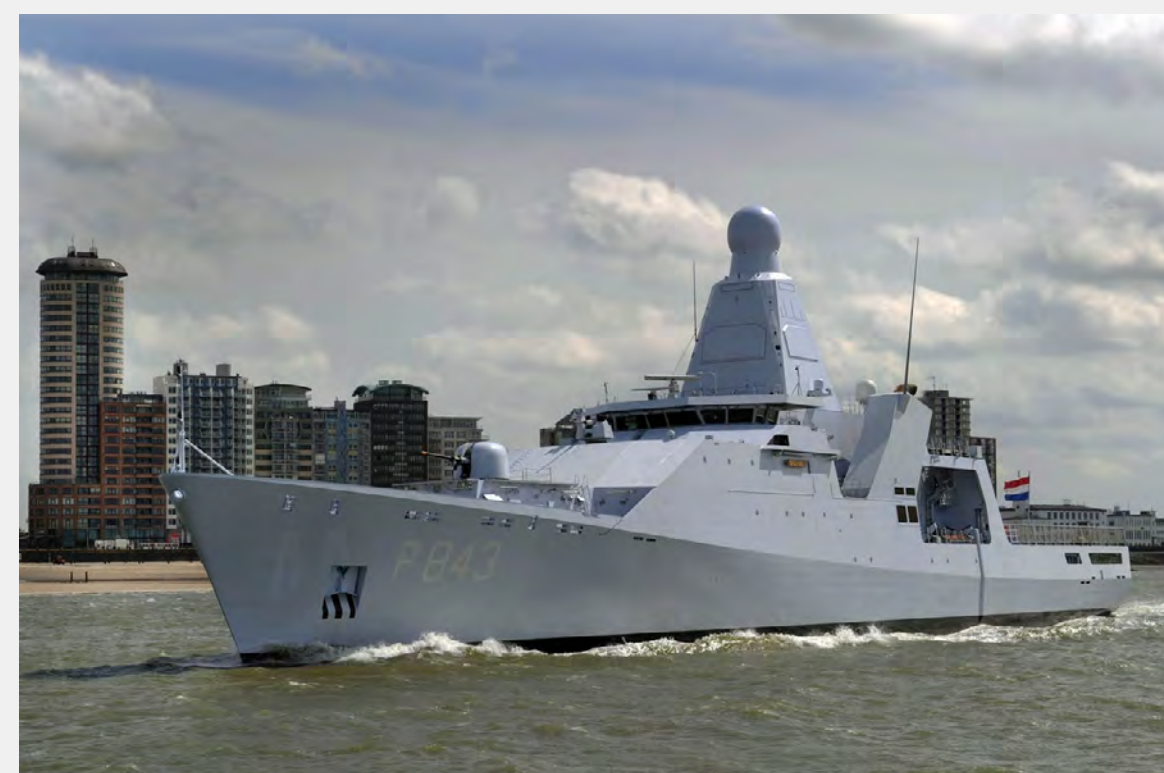
Zr. Ms. Groningen (2013)

CUSTOMER: Damen Schelde Naval Shipbuilding TYPE: Offshore Patrol Vessel (108.4 m) TYPE OF WORK: Newbuild SCOPE OF SUPPLY: Complete electrical systems integration, installing, supervising on site and commissioning.