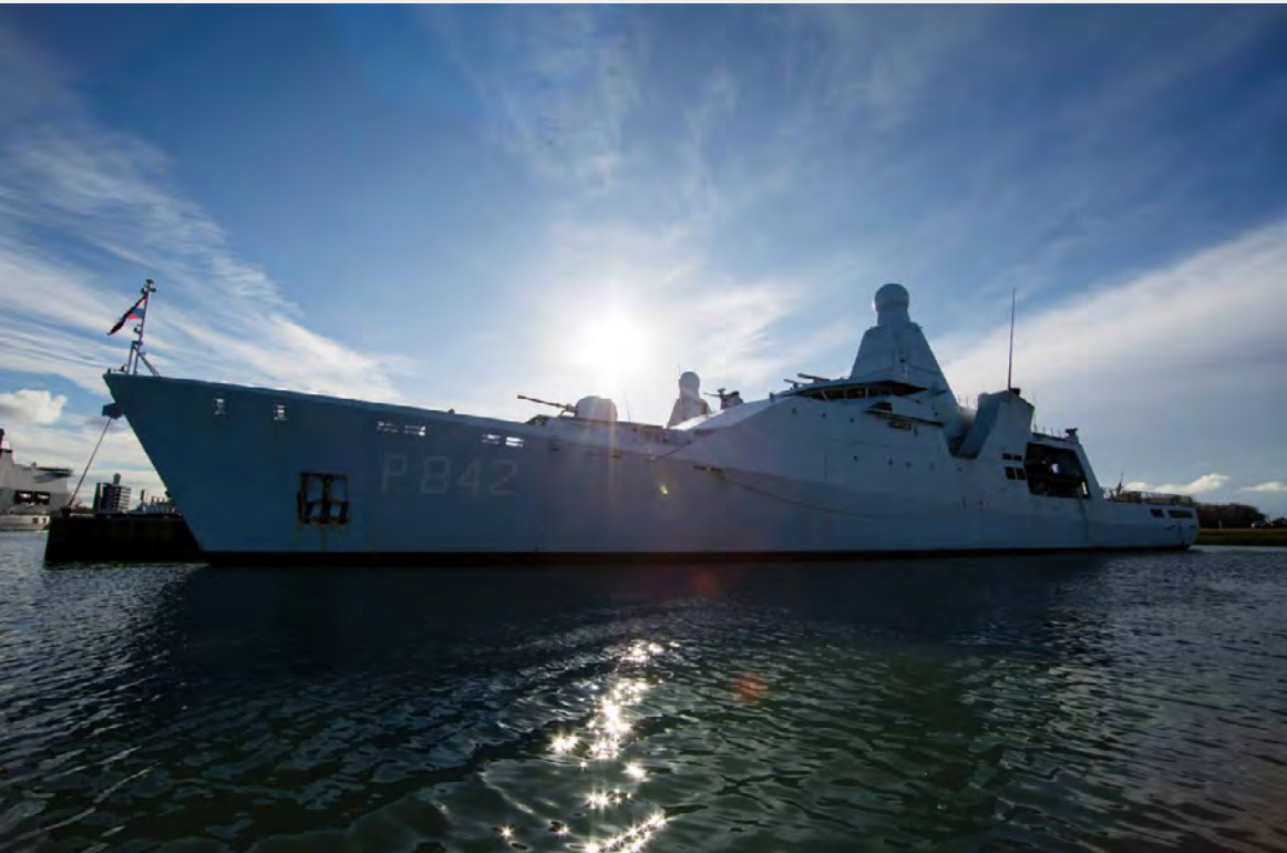
Zr. Ms. Friesland (2013)

CUSTOMER: Damen Schelde Naval Shipbuilding TYPE: Offshore Patrol Vessel (108.4 m) TYPE OF WORK: Newbuild SCOPE OF SUPPLY: Complete electrical systems integration, installing, supervising on site and commissioning.