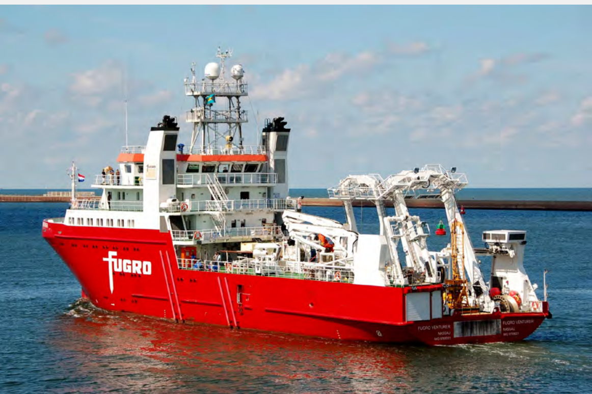
Fugro Venturer (2017)

CUSTOMER: Fassmer TYPE: Research & Survey vessel (72 m) TYPE OF WORK: Newbuild SCOPE OF SUPPLY: System integration, vessel automation, power distribution system; navigation and communication system, consoles.