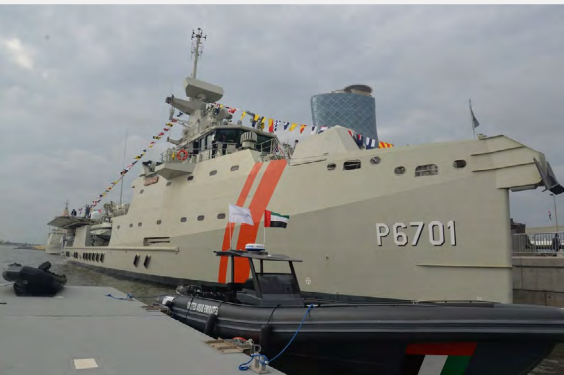
OPV 6711 UAE / Hmeem (2016)

CUSTOMER: Damen Shipyards Gorinchem TYPE: Offshore Patrol Vessel (67 m) TYPE OF WORK: Newbuild SCOPE OF SUPPLY: Electrical package delivery. Engineering, installing and commissioning.