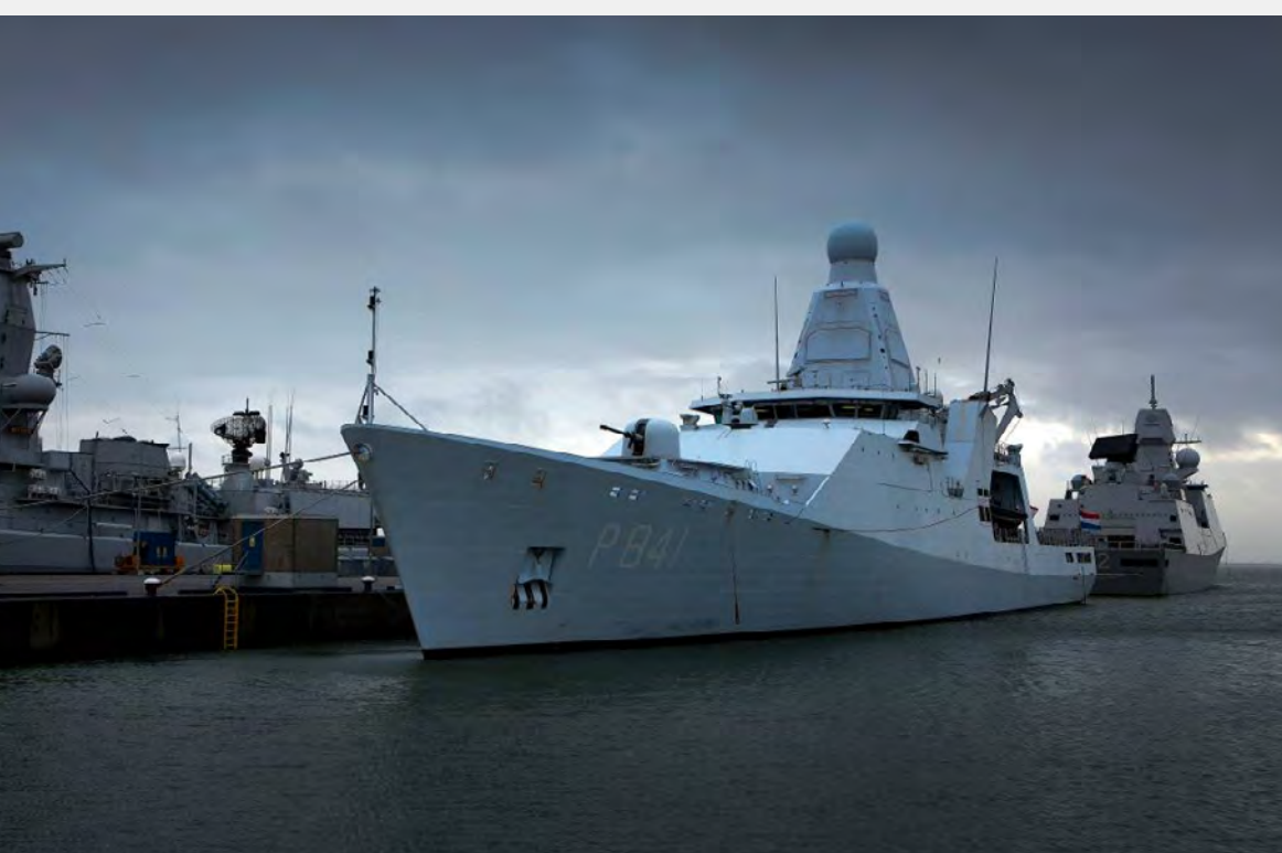
Zr. Ms. Zeeland (2013)

CUSTOMER: Damen Schelde Naval Shipbuilding TYPE: Joint Logistic Support Ship (204.7 m) TYPE OF WORK: Newbuild SCOPE OF SUPPLY: Installation of the electrical systems including command & control, PDU and production of 44 consoles.