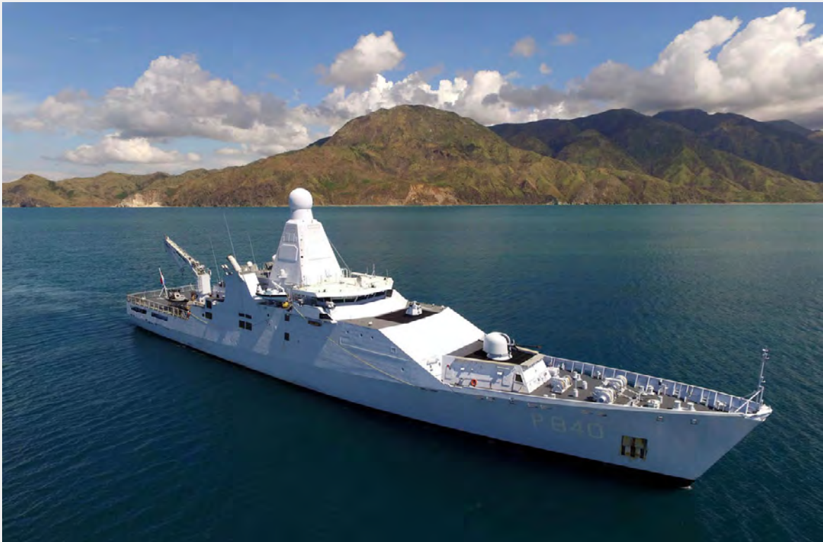
Zr. Ms. Holland (2012)

CUSTOMER: Damen Schelde Naval Shipbuilding TYPE: Offshore Patrol Vessel (108.4 m) TYPE OF WORK: Newbuild SCOPE OF SUPPLY: Complete electrical systems integration, installing, supervising on site and commissioning.