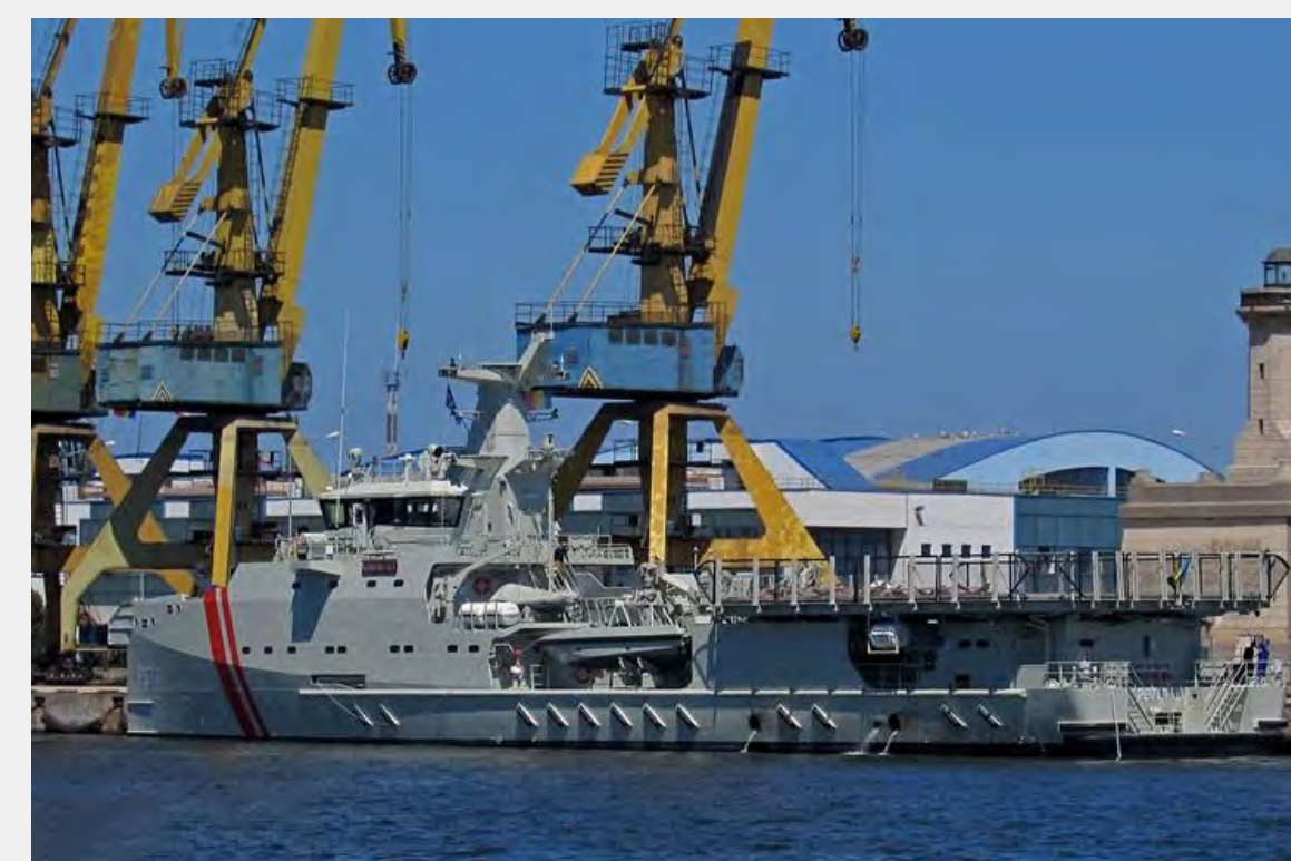
OPV 6711 UAE / Arialah (2016)

CUSTOMER: Damen Schelde Naval Shipbuilding TYPE: Guided-missile Frigate (105.1 m) TYPE OF WORK: Newbuild SCOPE OF SUPPLY: Engineering and integration of platform system, materials and equipment/system delivery, installing of cable and set to work activities.