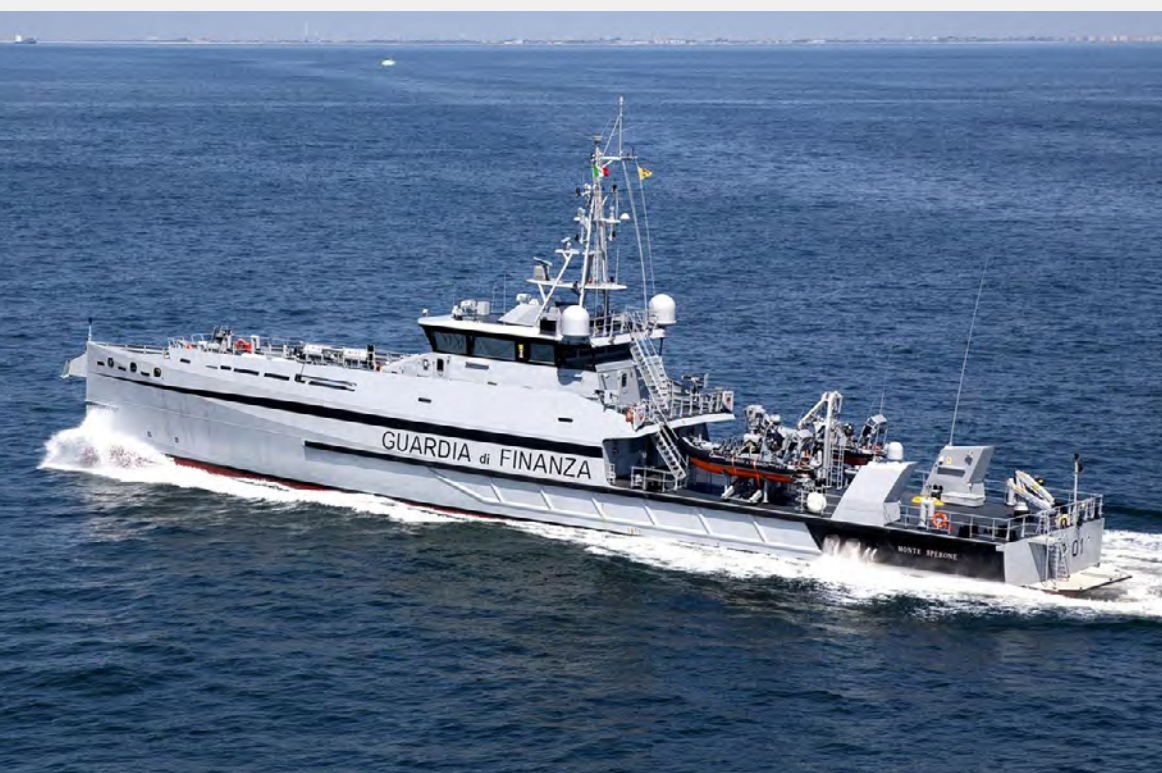
Stan Patrol 5509 (2015)

CUSTOMER: Damen Shiprepair Dunkerque TYPE: Research Vessel (50.9 m) TYPE OF WORK: Refit SCOPE OF SUPPLY: Life time extension. Electrical Installation.