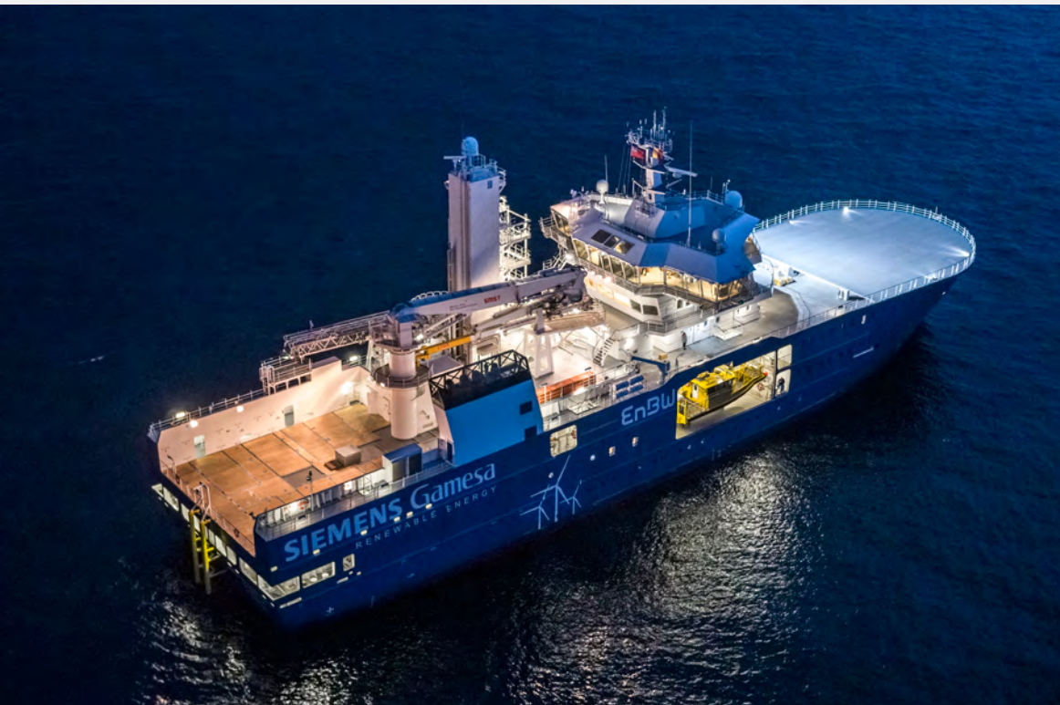
Bibby Wavemaster (2019)

CUSTOMER: Jumbo Maritime TYPE: Heavy Load Carrier (143.1 m) TYPE OF WORK: Service SCOPE OF SUPPLY: Refit AMCS, (network, PLC, SCADA).