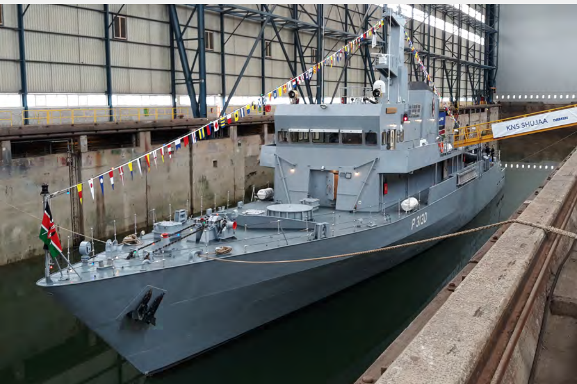
KNS Shujaa (2018)

CUSTOMER: DMI TYPE: Landing Platform Dock (166 m) TYPE OF WORK: Refit SCOPE OF SUPPLY: Modification electric installation hospital.