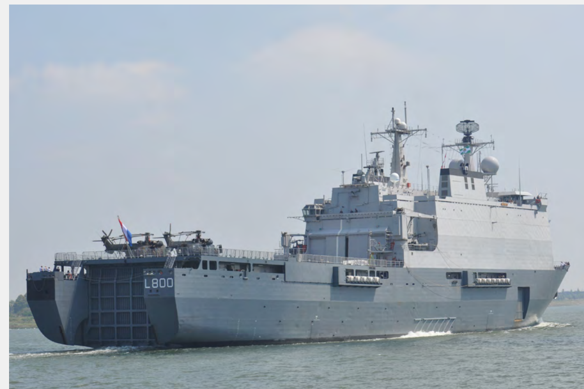
Zr. Ms. Rotterdam (2019)

CUSTOMER: R+S TYPE: Hydrografic Research Vessel (80 m) TYPE OF WORK: Refit SCOPE OF SUPPLY: Modifications PABX.