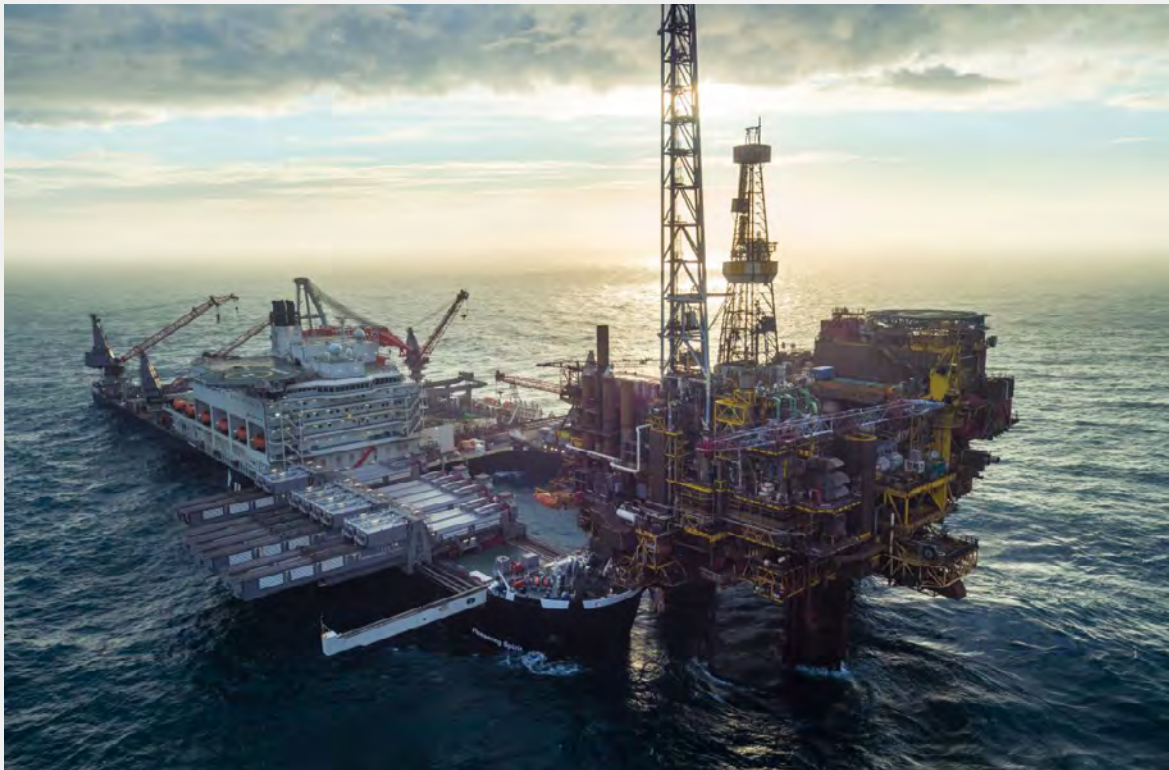
Pioneering Spirit (2020)

CUSTOMER: Damen Shipyard Mangalia TYPE: Offshore diamond recovery vessel (176.5 m) TYPE OF WORK: Newbuild SCOPE OF SUPPLY: Supply and installation of loose equipment and cables.