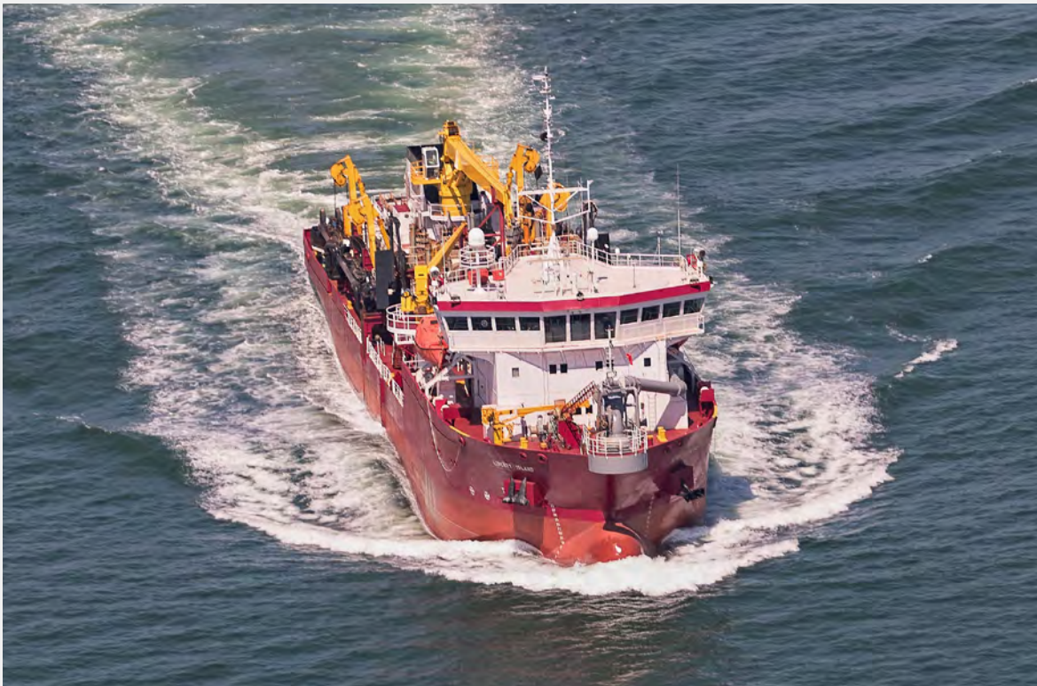
Liberty Island (2022)

CUSTOMER: Van Nieuwpoort Groep TYPE: Floating sand processing installation TYPE OF WORK: Refit SCOPE OF SUPPLY: Upgrades to the automation applications and electrical installations.