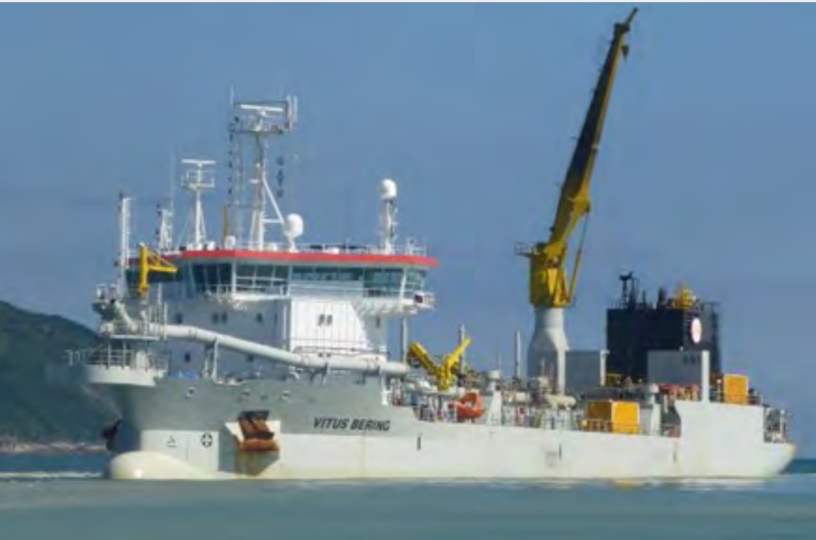
Vitus Bering (2018)

CUSTOMER: Jan de Nul TYPE: Hopper Dredger (7500 m³) TYPE OF WORK: Refit SCOPE OF SUPPLY: PC renewal AMCS + Refit DCS.