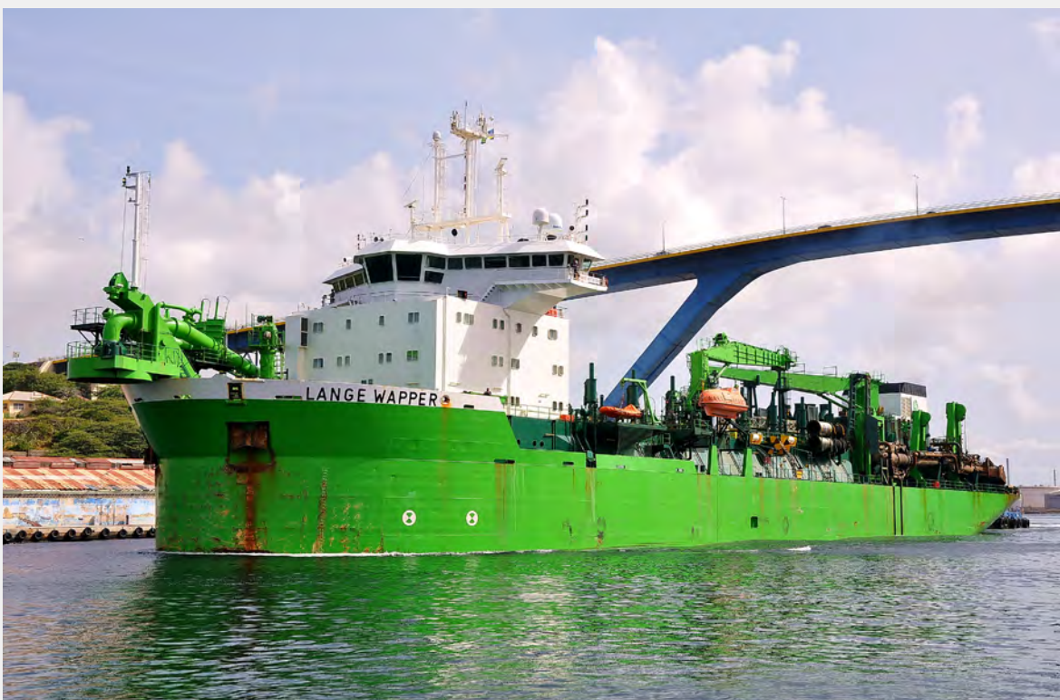
Lange Wapper (2019)

CUSTOMER: DEME TYPE: Trailing Suction Hopper Dredger (11796 m³) TYPE OF WORK: Refit SCOPE OF SUPPLY: Automation Systems.