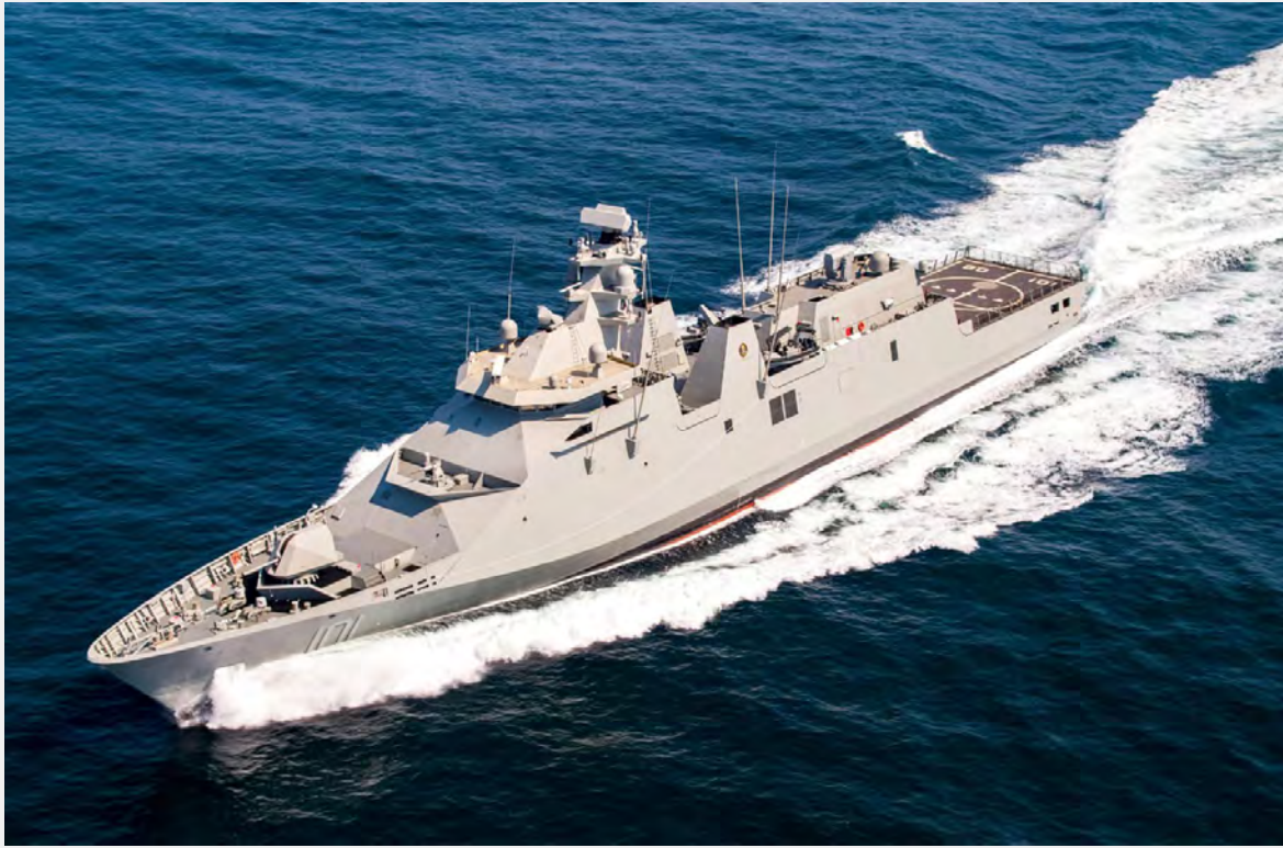
Arm Juarez (2020)

CUSTOMER: Damen Shipyards Gorinchem TYPE: Offshore Patrol Vessel 1900 (90 m) TYPE OF WORK: Newbuild SCOPE OF SUPPLY: Electrical package delivery. Engineering, installing, commissioning and supervision.