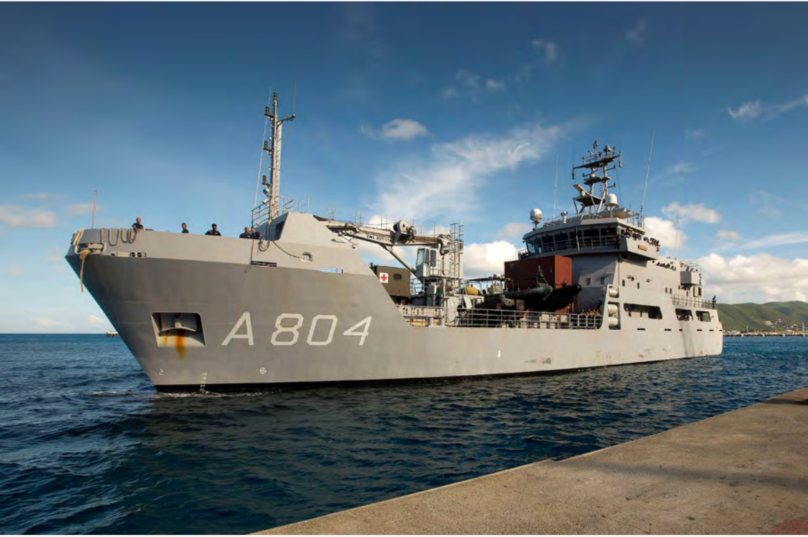
Zr. Ms. Pelikaan (2020)

CUSTOMER: Damen Schelde Naval Shipbuilding TYPE: Long Range Oceanic Patrol Vessel (107.5 m) TYPE OF WORK: Newbuild SCOPE OF SUPPLY: Complete electrical systems integration, installing, supervising on site and commissioning.