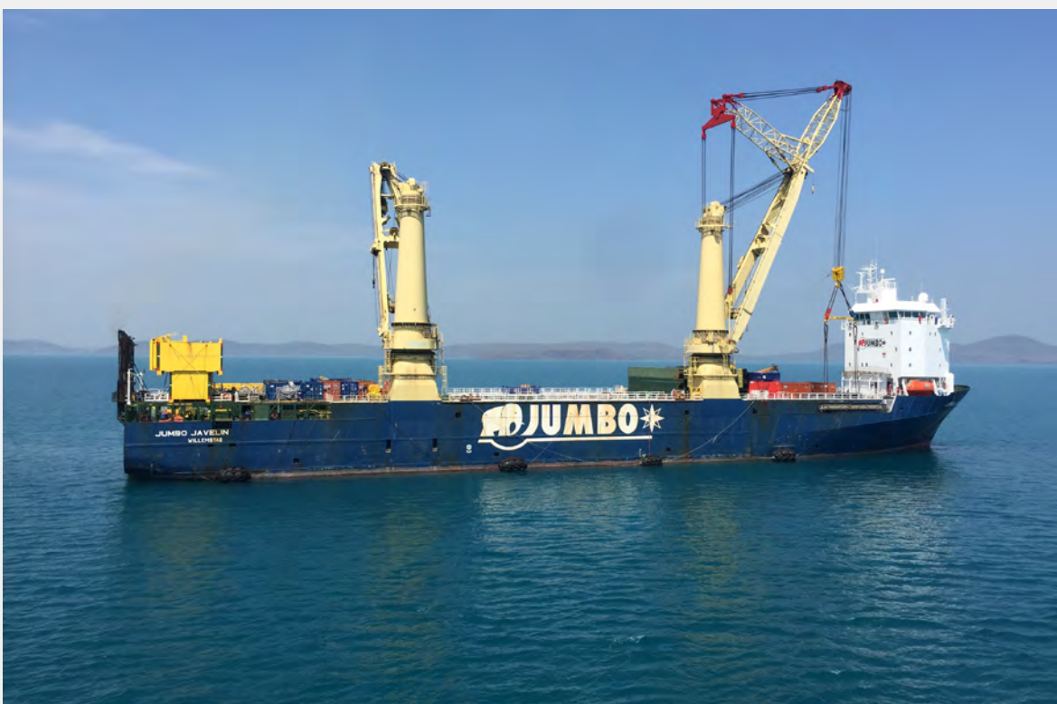
Jumbo Javelin (2020)

CUSTOMER: Allseas TYPE: Offshore Construction Vessel (150 m) TYPE OF WORK: Service SCOPE OF SUPPLY: Automation window heating system.