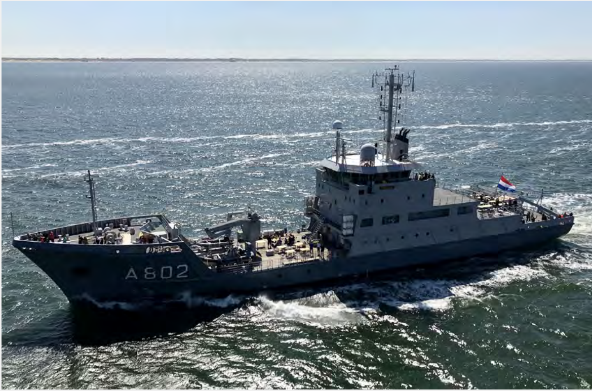
Zr. Ms. Snellius (2020)

CUSTOMER: Damen Shipyard Den Helder TYPE: Naval Auxiliary Vessel (65 m) TYPE OF WORK: Refit SCOPE OF SUPPLY: Mid-Life upgrade and maintenance.