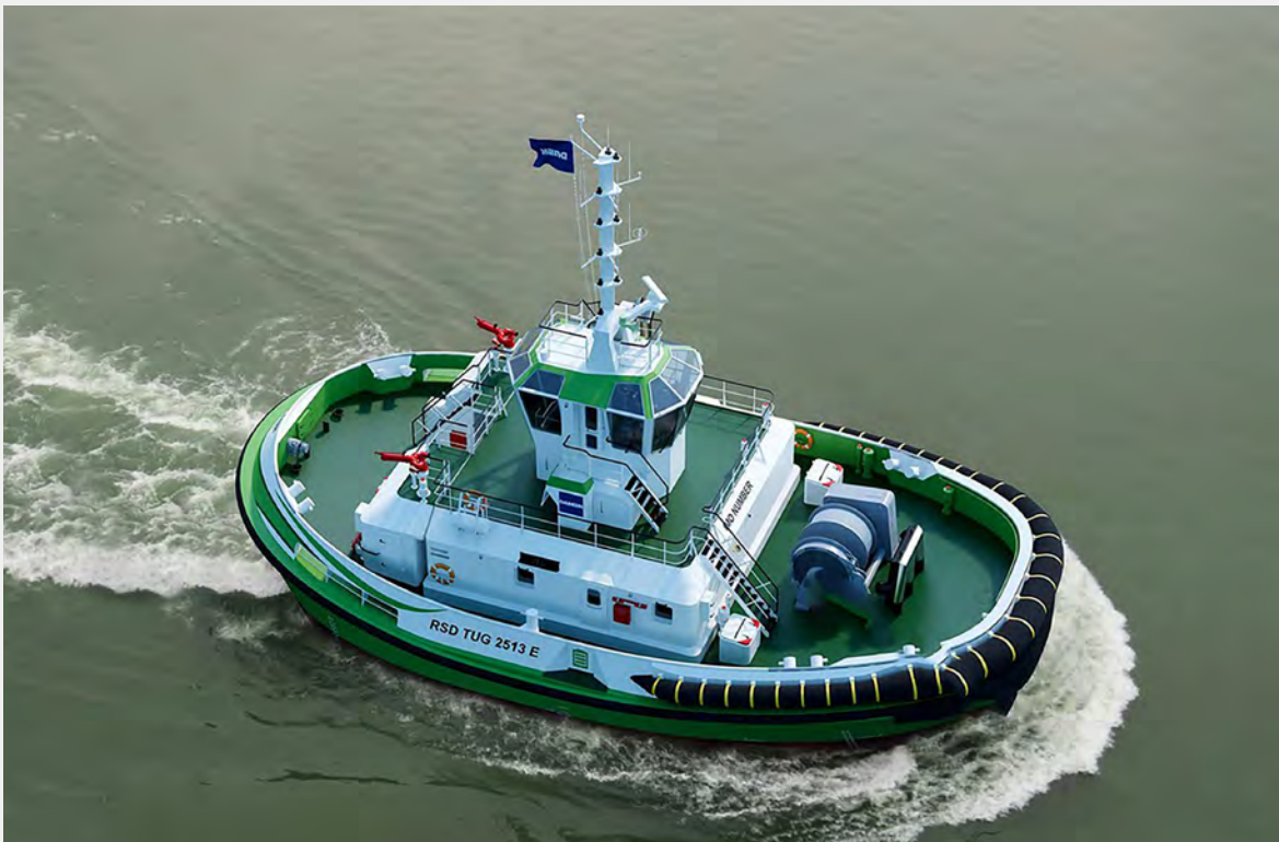
RSD2513 YN515011-16 (2020)

CUSTOMER: Damen Shipyards Gorinchem TYPE: Tug boat (23 m) TYPE OF WORK: Newbuild SCOPE OF SUPPLY: Switchboards and consoles.