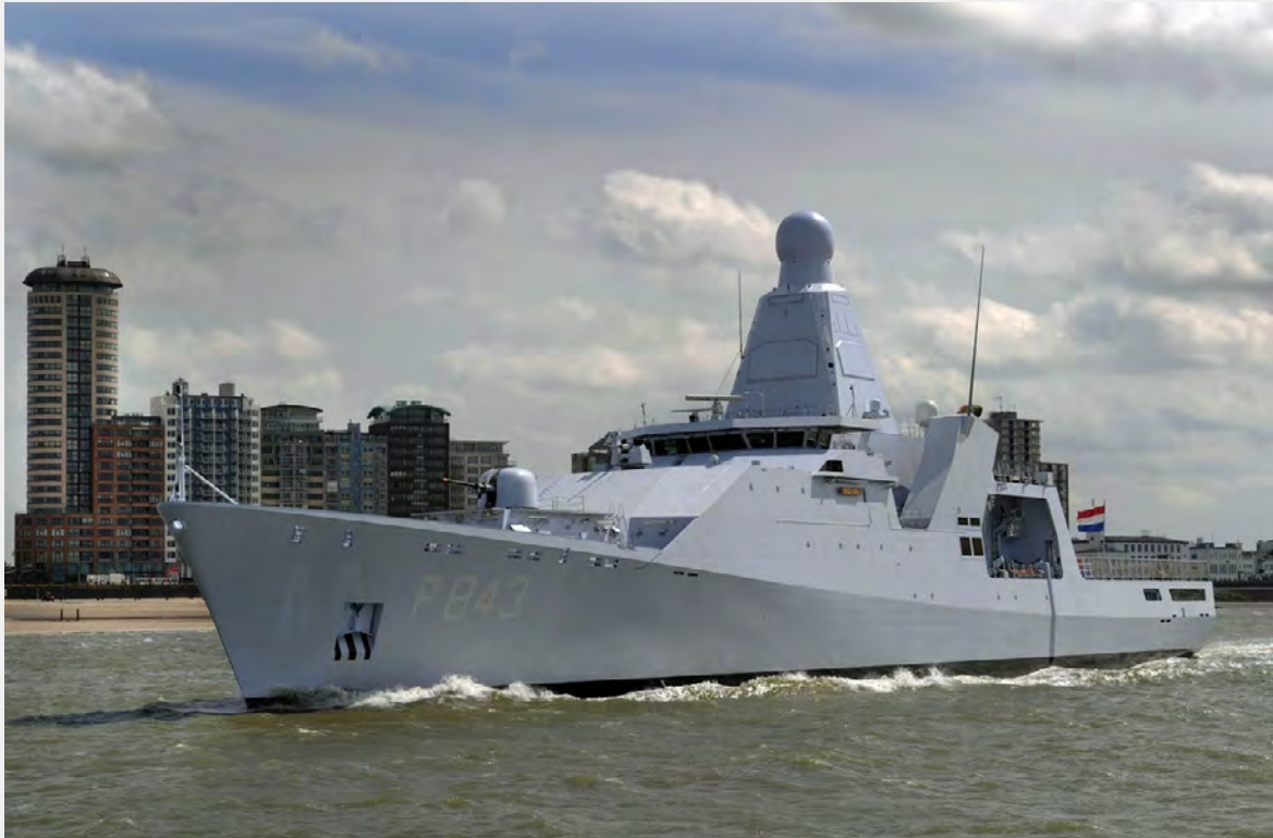
Zr. Ms. Groningen (2013)

CUSTOMER: Damen Schelde Naval Shipbuilding TYPE: Offshore Patrol Vessel (108.4 m) TYPE OF WORK: Newbuild SCOPE OF SUPPLY: Complete electrical systems integration, installing, supervising on site and commissioning.