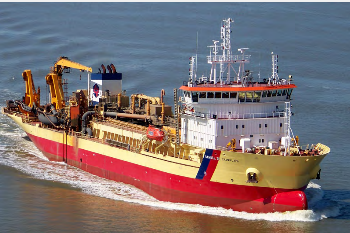
Samuel de Champlain (2018)

CUSTOMER: DEME TYPE: Trailing Suction Hopper Dredger (13700 m³) TYPE OF WORK: Refit SCOPE OF SUPPLY: Automation Systems, Draught and Loading System (ADLS), Alewijnse Suction Tube System (ASTS).