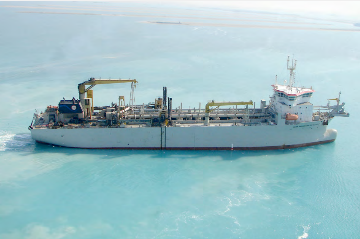
Juan Sebastián de Elcano (2023)

CUSTOMER: Jan de Nul TYPE: Hopper Dredger (16500 m³) TYPE OF WORK: Refit SCOPE OF SUPPLY: Renew and supply the Alarm and Monitoring System (AMS), Dredge Control System (DCS), Alewijnse Draught and Loading System (ADLS) and the Alewijnse Suction Tube System (ASTS).