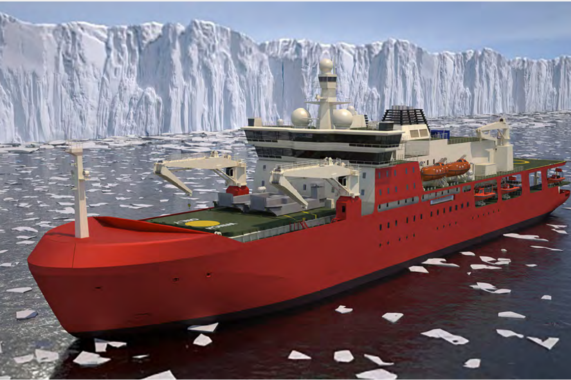
Nuyina, YN 417000 (2021)

CUSTOMER: Damen Schelde, Galați TYPE: ASRV Icebreaker, Research vessel (160 m) TYPE OF WORK: Newbuild SCOPE OF SUPPLY: Electrical Engineering and Integration, Equipment delivery, Supply and Installation of loose equipment and cables.