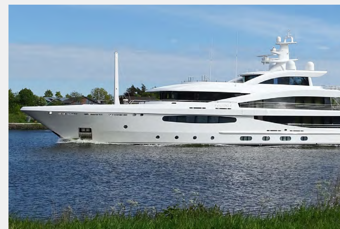
Volpini 2 (2018)

CUSTOMER: Oceanco TYPE: Motor Yacht (90m) TYPE OF WORK: Newbuild SCOPE OF SUPPLY: Systems integration and complete electrical installation, AMCS.