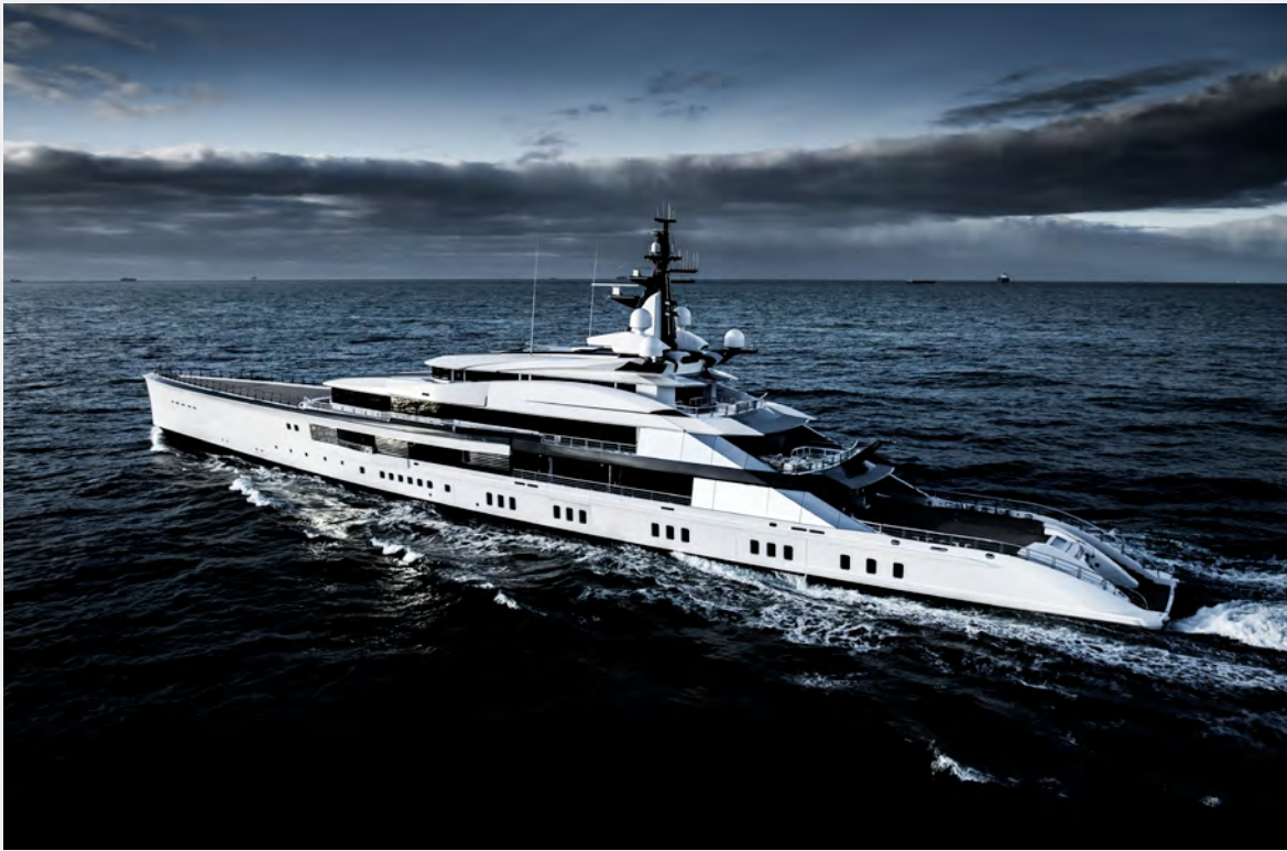
Bravo Eugenia (2018)

CUSTOMER: Oceanco TYPE: Motor Yacht (90 m) TYPE OF WORK: Newbuild SCOPE OF SUPPLY: System integration and complete electrical installation, IT systems, AMCS.