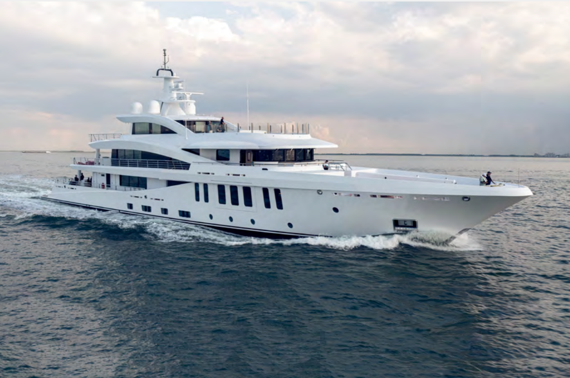
Moonstone, Amels BN18803 (2021)

CUSTOMER: Damen Yachting TYPE: Motor Yacht (60 m) TYPE OF WORK: Newbuild SCOPE OF SUPPLY: E-installation, Energy Storage, Navcom