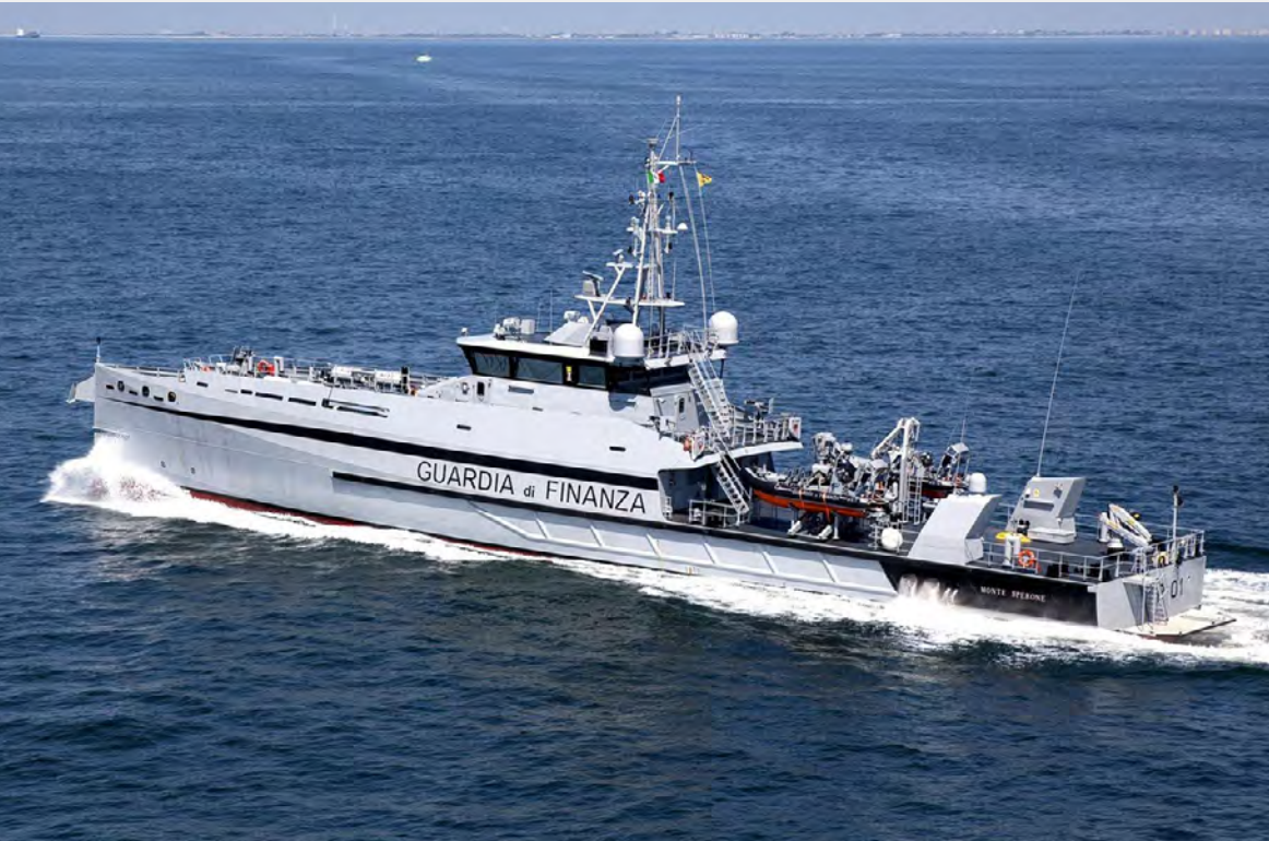
Stan Patrol 5509 (2015)

CUSTOMER: Damen Shiprepair Dunkerque TYPE: Research Vessel (50.9 m) TYPE OF WORK: Refit SCOPE OF SUPPLY: Life time extension. Electrical Installation.