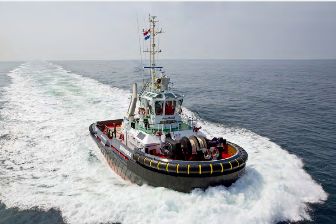
ASD2810 YN513520-21 (2019)

CUSTOMER: Damen Shipyards Gorinchem TYPE: Tug boat (23 m) TYPE OF WORK: Newbuild SCOPE OF SUPPLY: Switchboards and consoles.