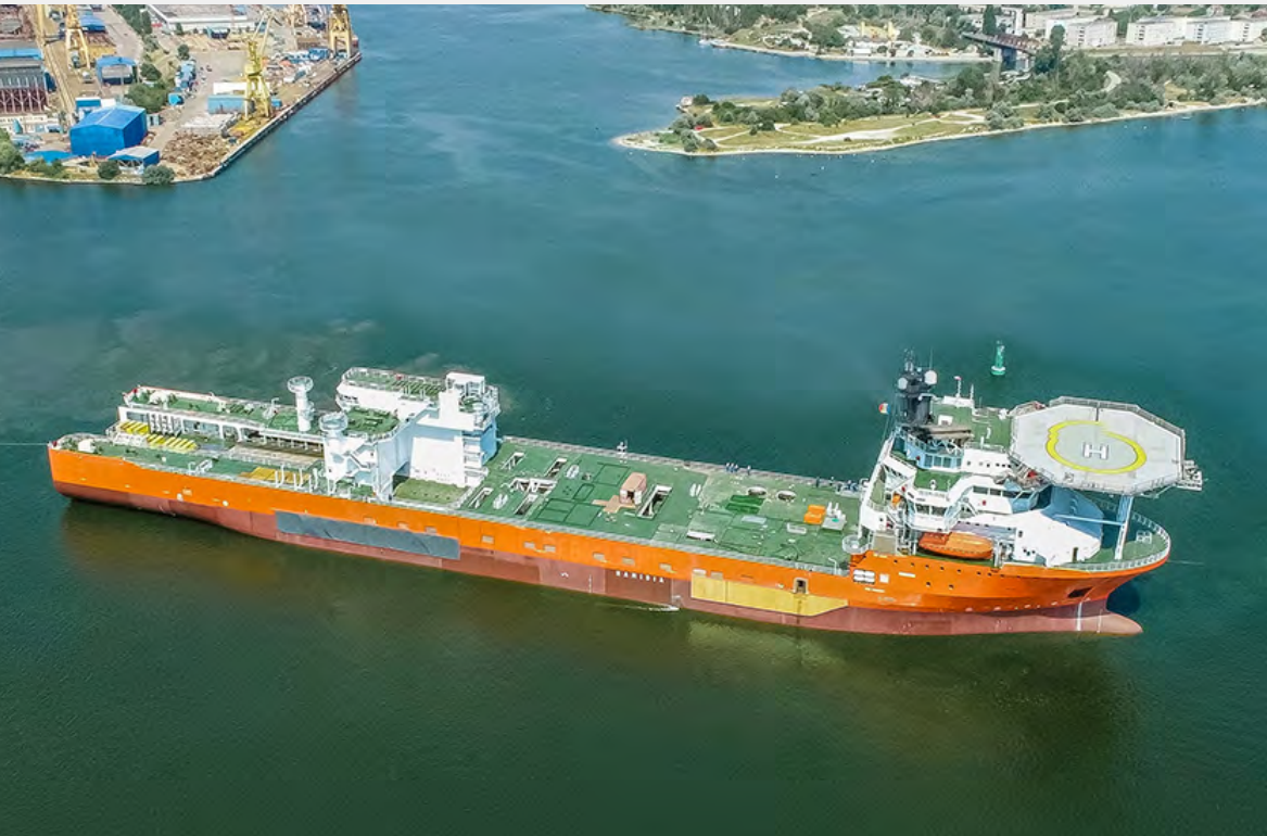
Benguela Gem, YN 594001 (2021)

CUSTOMER: IHC and McDermol TYPE: Pipe Laying Vessel (199m) TYPE OF WORK: Refit SCOPE OF SUPPLY: Installation of all electric cabling for complete refit.