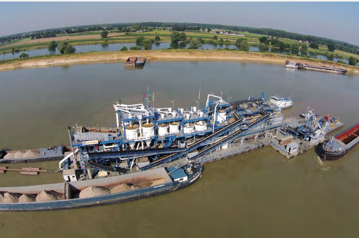
Kaliwaal 41 (2022)

CUSTOMER: Jan de Nul TYPE: Hopper Dredger (16500 m³) TYPE OF WORK: Refit SCOPE OF SUPPLY: Renew and supply the Alarm and Monitoring System (AMS), Dredge Control System (DCS), Alewijnse Draught and Loading System (ADLS) and the Alewijnse Suction Tube System (ASTS).