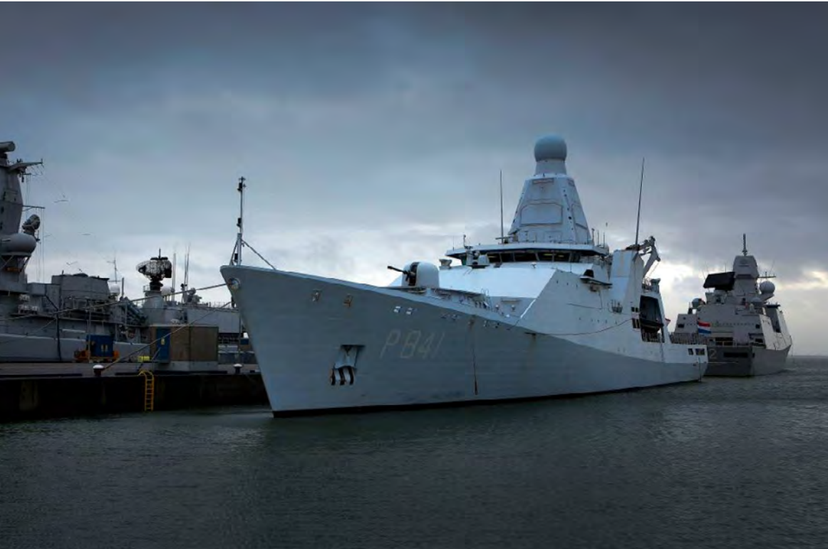
Zr. Ms. Zeeland (2013)

CUSTOMER: Damen Schelde Naval Shipbuilding TYPE: Joint Logistic Support Ship (204.7 m) TYPE OF WORK: Newbuild SCOPE OF SUPPLY: Installation of the electrical systems including command & control, PDU and production of 44 consoles.