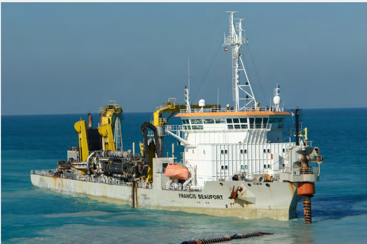
Francis Beaufort (2021-2022)

CUSTOMER: Barkmeijer Shipyards B.V. TYPE: Trailing Suction Hopper Dredger (105.9 m) TYPE OF WORK: Newbuild SCOPE OF SUPPLY: Electrical installation