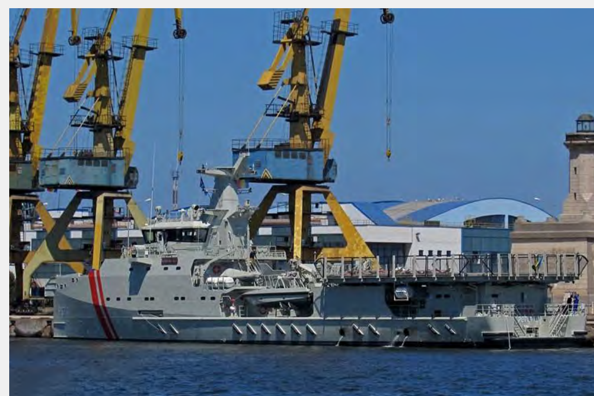
OPV 6711 UAE / Arialah (2016)

CUSTOMER: Damen Schelde Naval Shipbuilding TYPE: Guided-missile Frigate (105.1 m) TYPE OF WORK: Newbuild SCOPE OF SUPPLY: Engineering and integration of platform system, materials and equipment/system delivery, installing of cable and set to work activities.